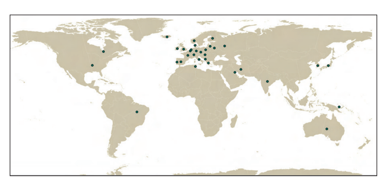
Figure 1. Map of countries which the 17th ICA 122 participants came from.

The 17<sup>th</sup> International Colloquium on Amphipoda was opened by James K. Lowry & Alan A. Myers; they reported a new classification of Amphipoda, establishing the new order Ingolfiellida (Lowry & Myers, 2017). From the first contributions, it pointed out clearly that our knowledge on