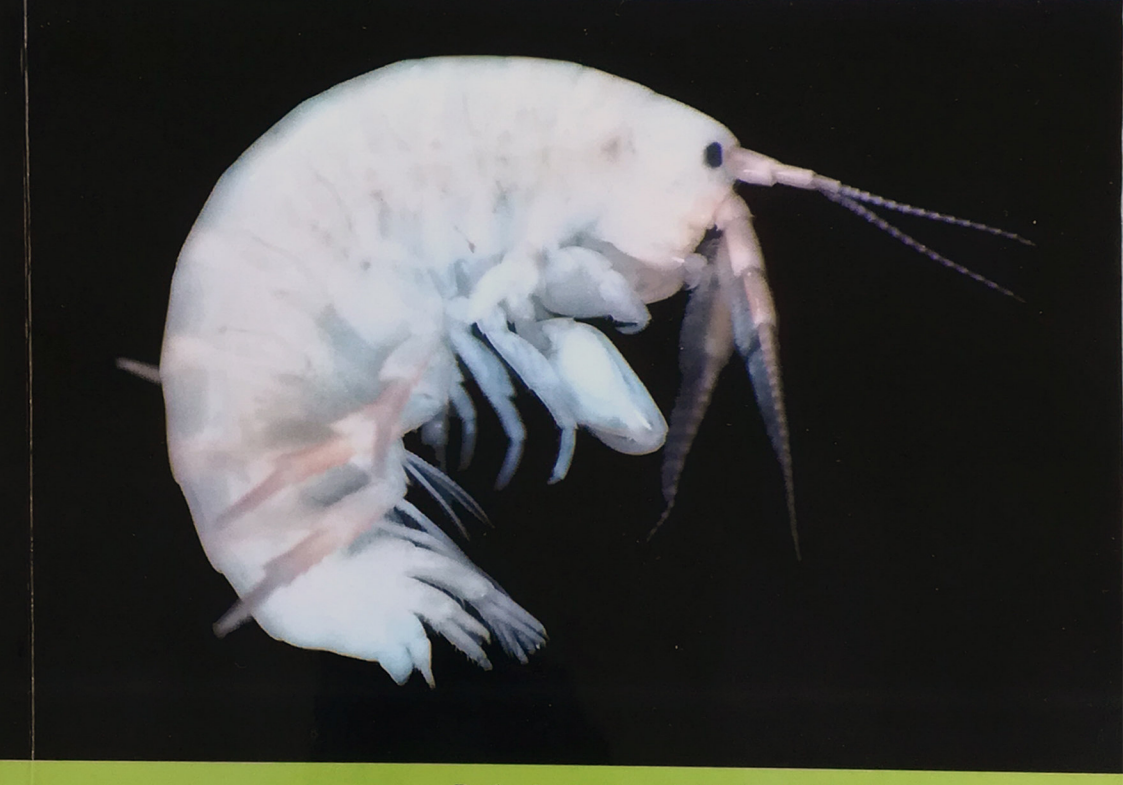
Parhyale plumicornis (Heller, 1866) - Amphipoda Hyalidae

Proceedings of the 17<sup>th</sup> International Colloquium on Amphipoda (17<sup>th</sup> ICA), September 4<sup>th</sup>-7<sup>th</sup> 2017, Trapani (Italy)