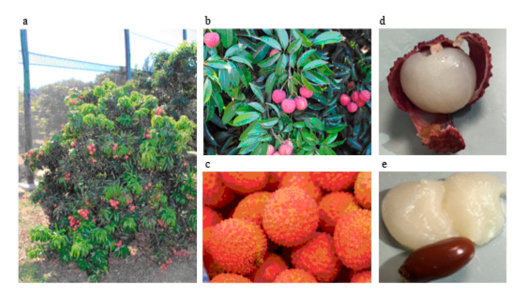
Figure 2. Sicilian Litchi chinensis tree, Kway May cultivar ( a ), Sicilian Litchi fruit. Kway May ( b ) and Way Chee ( c ) cultivars. The details of the pulp and seed are reported in ( d , e ), respectively.

Litchi fruit is rich in carbohydrates and fibers while lipids and proteins are scarce (Table 1). It is also appreciated for its nutritional properties: in fact the fruit is very rich in nutraceuticals, fundamental compounds with extra health benefits in addition to the basic nutritional value found in foods. Beyond the differences between cultivars of various origins, the beneficial effects of fruits have been partly related to their high contents in micronutrients including vitamins (B1, B2, B3, B6, C, E, K), carotenoids, minerals (potassium, copper, iron, magnesium, phosphorus, calcium, sodium, zinc, manganese, and selenium), and polyphenols (Table 1), which are highly represented in comparison with other tropical fruits [11,12].