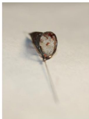
Fig. 4. Macroscopic embolic material after distal embolic protection filter removal.