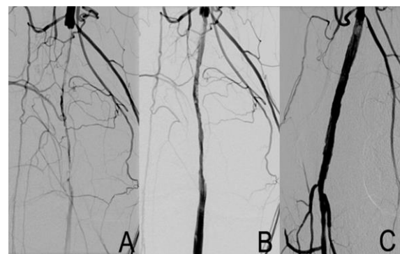
Fig. 3 Intraoperative angiogram. A. Superficial femoral and popliteal artery occlusion. B. Femoro-popliteal pre-dilatation. C. Postprocedural result after plaque excision with Turbohawk.

Preoperatively mean ABI was 0.35 \pm 0.2 . At one year ABI increased significantly to 0.60 \pm 0.32 ( P < .001 ). All patients had improved clinical status according to Rutherford classification (Baseline and follow up data to be inserted). Mean procedure time was 99 minutes (range 80-122; SD: 30) and mean fluoroscopy time was 29 minutes (range: 21-35; SD: 7.5).