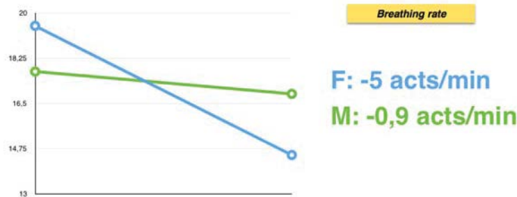
Figure 2. Breathing rate.