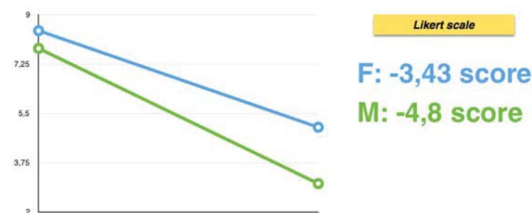
Figure 4. Likert scale.