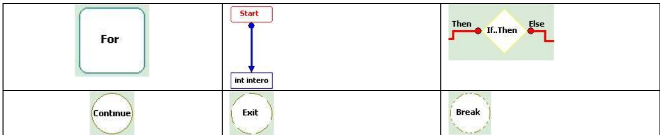
Table 1: Example of Icons.

Loop Control Structures: they provide a breakpoint for the execution flow, they refer to variable length code portions, thus its iconic representation is obtained with a quadratic shape with smoothed corners, its size is larger than the others in order to highlight both the dynamism on the size of the instructions to be executed and that the block is subject to execution conditions.