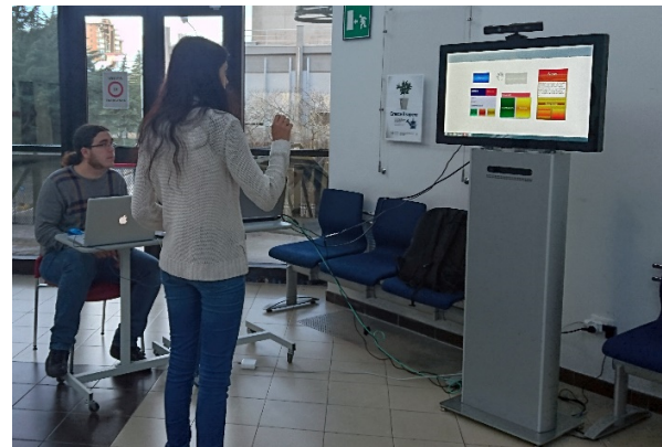
Figure 2. A user interacts with the HIG-based interface during our comparison study.

A public display was installed in a public transit area inside a building within the University campus in Palermo. This is an area where students of several disciplines and different age typically hang out. We asked 12 students (7 male, 5 female) to interact with our system, testing both interfaces for each participant ("within subject" set up).