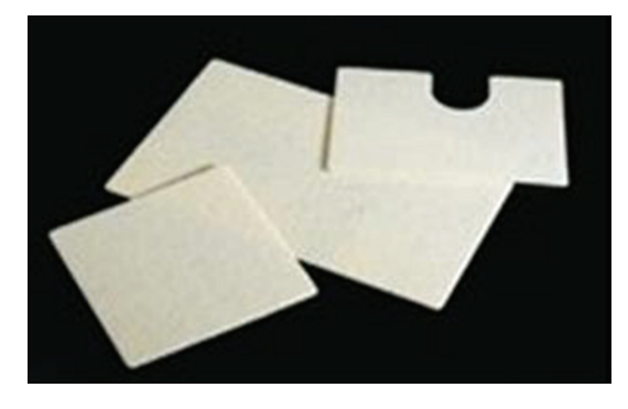
Figure 5: Gore Bio-A Tissue Reinforcement.