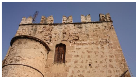
Figure 1. The tower of Palazzo Alliata Pietratagliata in Palermo

The second step was the testing of nanostructured products for the consolidation. Indeed, since for this purpose it was not possible to take the necessary amount of samples directly from the tower, the study proceeded on the limestone of Marsala, intended as the lithotype with structural and textural characteristics similar to the one used in the battlements of the tower. On these stone samples other analyses were performed: determination of bulk (MVA) and real (MVR) density through helium picnometer, water open porosity measurement through the method of the hydrostatic balance, x-ray diffractometry, porosimetry through nuclear magnetic resonance (NMR) relaxometry and scanning electron microscopy (SEM). Moreover, after an induced aging of the specimens for simulating the desegregation of the stone, two nanostructured products for the consolidation, both based on nanosilica, have been applied. Then, two more cycles of diagnostics have been performed in order to understand the effect of the products on the stone. The results obtained through these various experimental techniques are reported and extensively discussed.