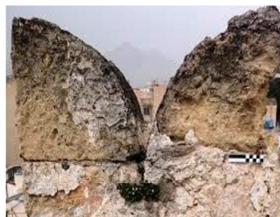
Figure 2. Detail of the stone decay