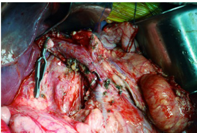
Fig. 3. The primary tumor has been completely resected with pancreaticoduodenectomy. Resection line of the superior mesenteric vein (arrow). The right hepatic artery (arrow-head), replaced from superior mesenteric artery. PV, portal vein; PS, pancreatic stump.

According to the pathological changes described above, the current method used for isolated Roux-en-Y reconstruction has a physiological basis. Our method of reconstruction has been successfully used in more than 80 adults [17] and now appears to be a safe and effective procedure for children. Our method for Roux-en-Y reconstruction leaves the patient closer to normal human digestive physiology than prior techniques and thus might