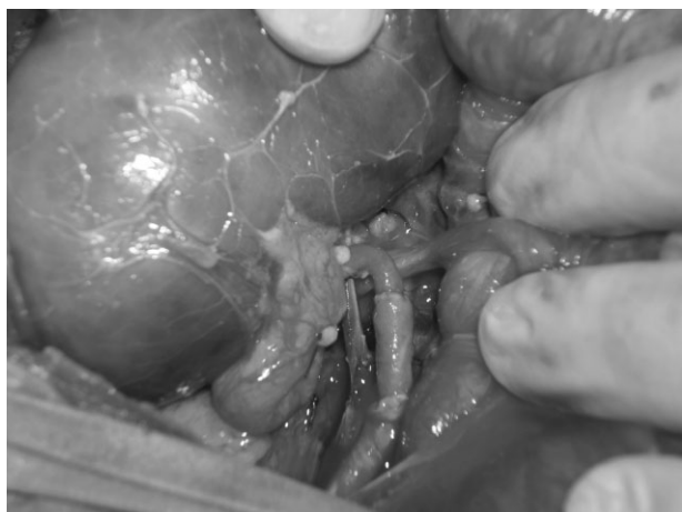
FIG. 4. Close-up showing the arterial and venous anastomoses (note the jugular vein graft).

their longitudinal axis, as described by the instructions for use provided by the manufacturer. A small incision was subsequently made on the iliac vein to allow the tangential introduction of the anvil. Once the correct positioning of the device was checked, it was armed and the end-to-side anastomosis performed. It was necessary to give a 6/0 Prolene stitch to close the vasotomy. No further stitches were needed to fix the anastomosis (Fig. 4). The same procedure was performed for the renal artery.