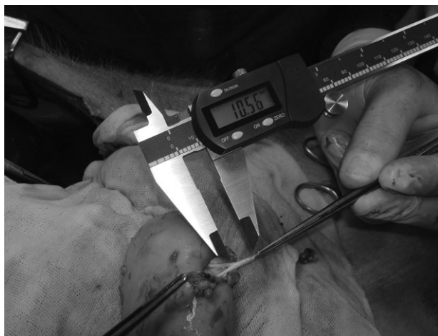
FIG. 2. Measurement of renal artery length and caliber.

The C-Port Flex-A plus distal anastomosis system is a single-use tool that integrates the functions necessary to perform an end-to-side anastomosis in about 15 s, delivering 13 stainless steel micro staples that circumferentially connect the graft to the target vessel in a compliant fashion. The device is composed of three parts: (i) the handler that contains the CO 2 reservoir for pneumatic/gas-driven anastomosis and the trigger lever; (ii) the flexible neck; and (iii) the