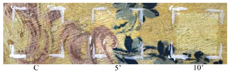
Fig. 3. Polychrome wood: C = Control (reaction solution without BMP, gelled by Klucel-G); bioremoval performed by application of gelled enzymatic solution for 5 and 10 minutes