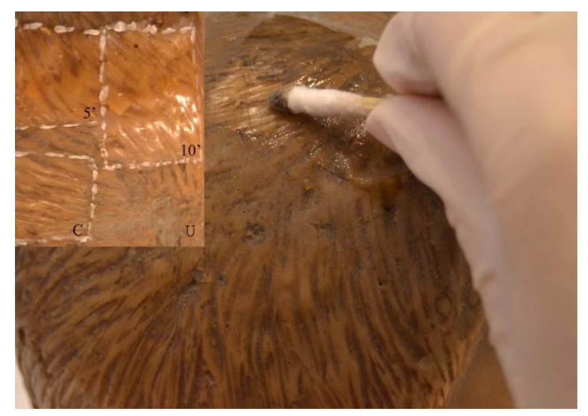
Fig. 4. Wax sculpture. U - Untreated area. C - control, reaction solution without BMP, gelled by Klucel G. 5'-10' - application of gelled enzymatic solution, by paintbrush, for 5 or 10 minutes. Right side = removal of gelled solution by cotton swab.

An altered protein layer was removed from wax sculpture surface after 5 and 10 minutes of application at 19°C (Fig. 4). Control test, performed applying the reaction solution without BMP, was also performed; results are showed in Table 2.