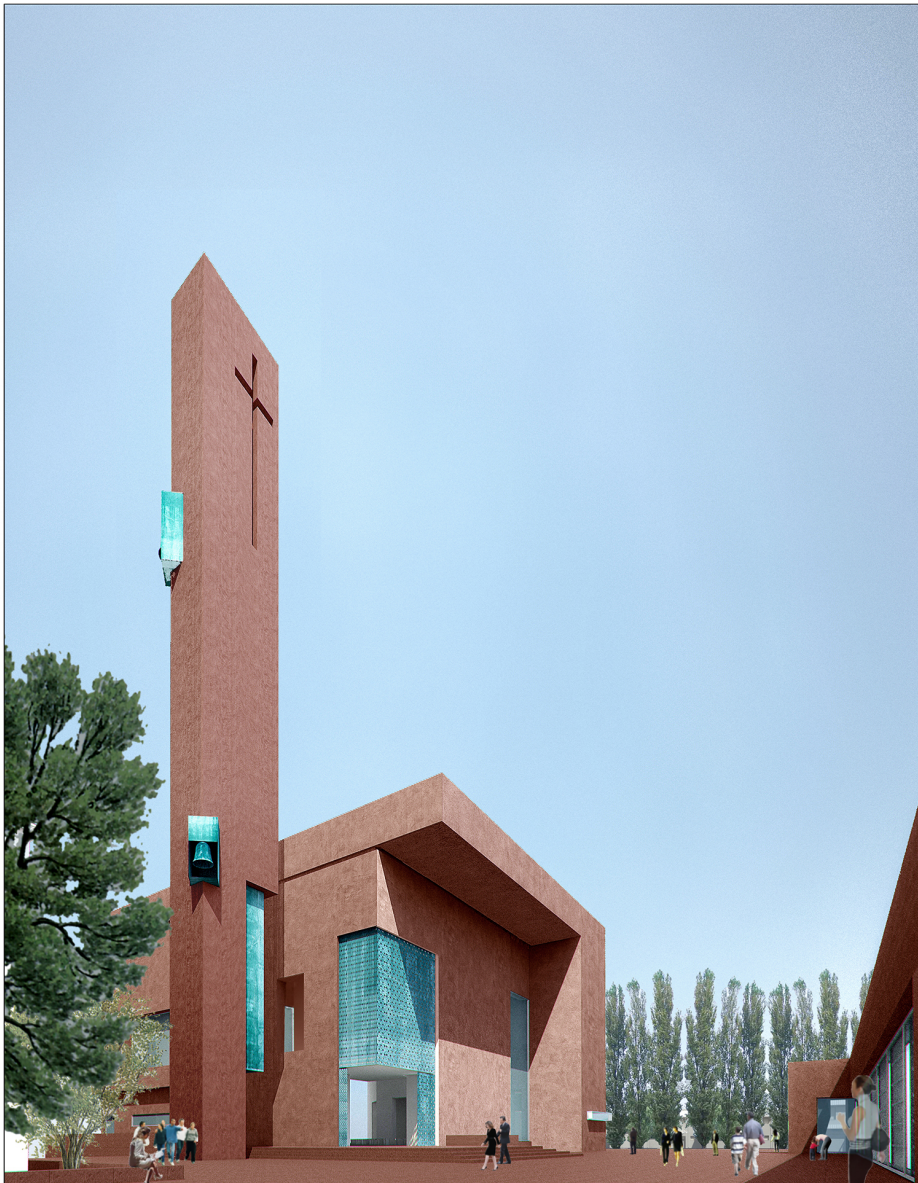
Vista dal sagrato