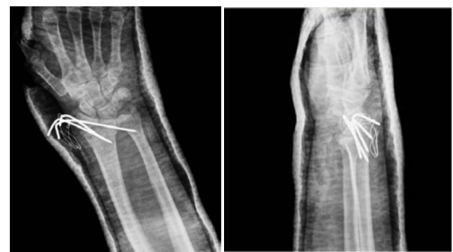
Figure 4b: We choose to treat this fracture with closed reduction and k-wires fixation, removed after one month.