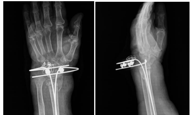
Figure 3b: We choose a closed reduction and a fixation with Epibloc.