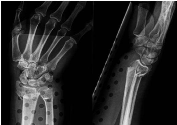
Figure 2a: Woman, 71 years old fell from stairs at her home and sustained a bilateral wrist fracture.