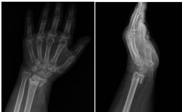
Figure 3a: This 75 years old retired man fell in his garden and sustained a distal radius fracture.