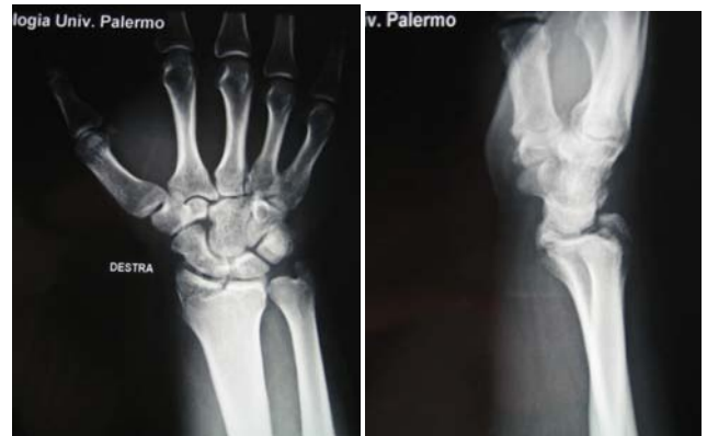
Figure 4a: This 70 years old woman fell in a supermarket and sustained this articular fracture of the radial styloid.