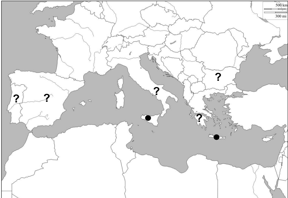
Fig. 2. Distribution of Smyrniium dimartinoi from the studied herbarium specimens (circles) and likely distribution (?).