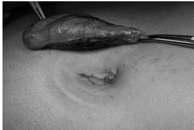
Fig. 1 - Umbilical scar with intradermal suture.

The patients began taking small quantities of fluid a few hours after surgery and could eat the following day. All patients were discharged with the prescription of low molecular weight heparin (LMWH) for prevention of thromboembolic disease.