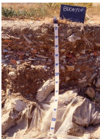
Figure 7. Technosols mainly made by artifacts.

Man, now considered the sixth and most incisive factor of pedogenesis, will increasingly influence the soils of tomorrow (Dudal, 2005). It is therefore justified the