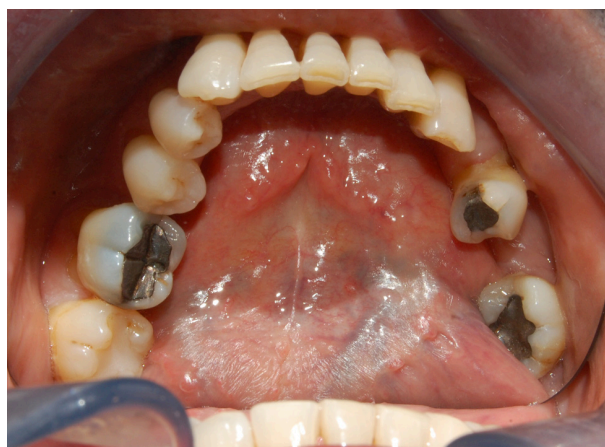
Figure 3 Dry and sticky appearance of oral mucosa in a radiotherapeutic patient.

Another issue is the high incidence of yeast infections during xerostomia. 48 An example being the C. albicans infection, which is very common in both dentate and edentulous individuals and allows a colonization of oral mucosae 49 increasing the risk of oral mucosal infections. 50