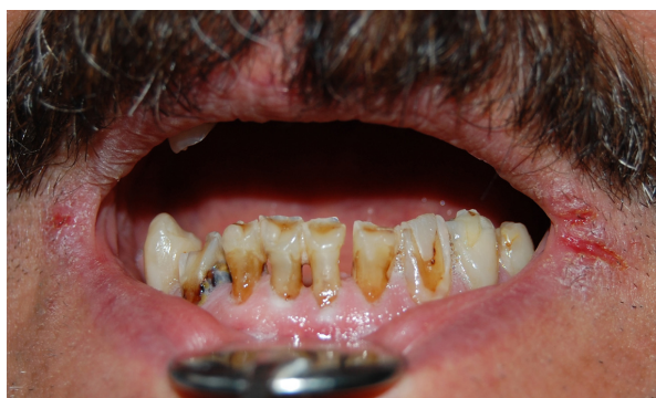
Figure 4 Cheilitis and cracked lips, and teeth cervical caries in a radiotherapeutic patient.

Therapy options in xerostomia depend on the presence of residual secretion or the absence of it. When residual