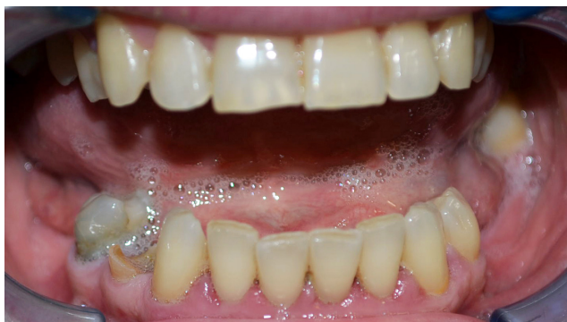
Figure 2 Viscous appearance of the saliva in a radiotherapeutic patient.

A further complication that tends to occur later in irradiated patients is the increased risk of developing dental caries and oral infections, due to the alterations in the saliva flow and consequently in oral microflora. 36 The decay is most often recurrent or primary and located at sites generally not usually susceptible to caries such as the cervical margins, incisal margins, or the tips of teeth (Figure 4).