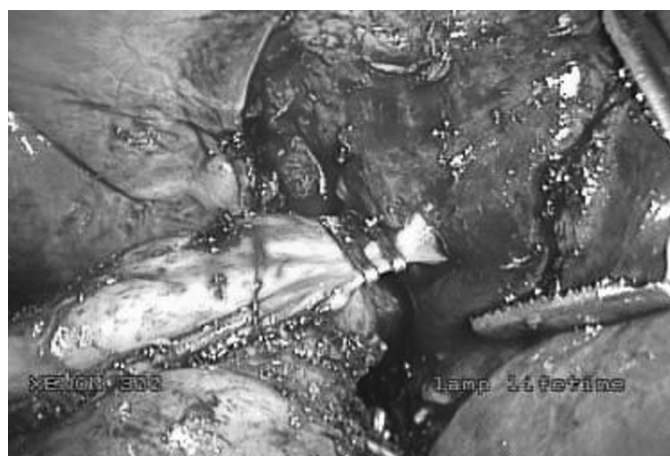
Fig. 3: Accessory cystic duct clipping.