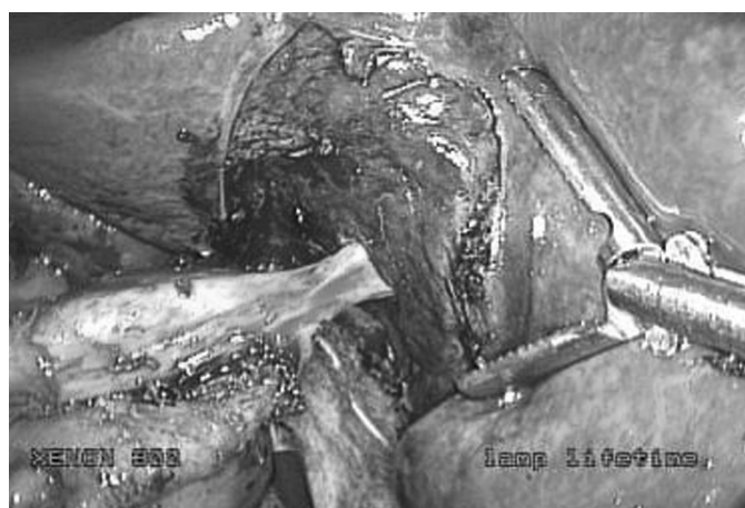
Fig. 2: Accessory cystic duct isolation.