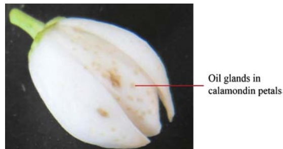
Fig. (3). Oil glands in calamondin petals.

The present chapter deals with the actual and potential applications of citrus EOs in the different fields of human life and activity.