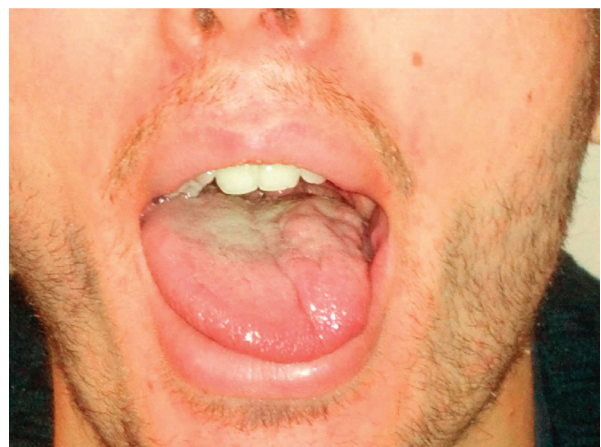
Figure 2. Unilateral hypoglossal nerve palsy. After 30 months of follow-up the patient's neurological examination remained unchanged.