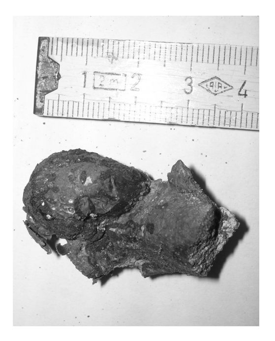
Figure 8. Crucified Christ papier-mache fragment found in the sample from via Spinuzza, Cefalù.