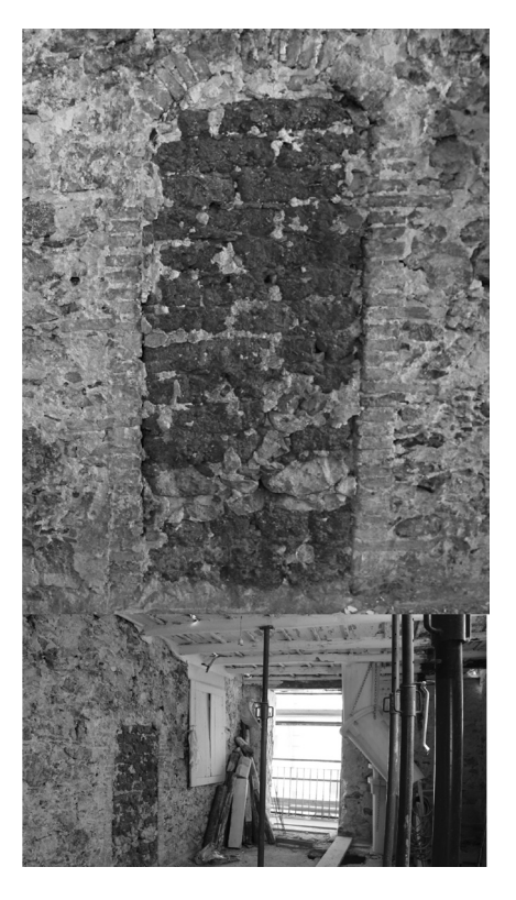
Figure 11. Empty in a stone-wall, filled-up by earth bricks, in a old building in via Vanni, Cefalù.