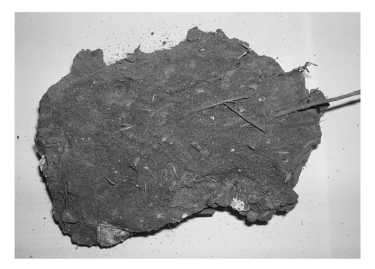
Figure 6. A piece of the sample of adobe extracted in via Spinuzza a Cefalù.

Now the adobe wall is covered by plaster, and only in two little recesses has it been left visible. In 2012 a sample was removed (Fig. 6), to examine the components of the mixture forming the bricks (whose dimensions are about 8 \times 18 \times 40 cm). Preliminary analysis showed that slightly clayey earth was kneaded with sand and with heterogeneous aggregates: straw and terracotta fragments, bone splinters and slivers of wood, pieces of reed or little shells (Fig. 7). Radiocarbon dating carried out by CEDAD (CEntro DAtazione e Diagnostica, University of Salento) on the vegetable fibres contained in the sample, date this find to a period range most probably around 1640 AD.