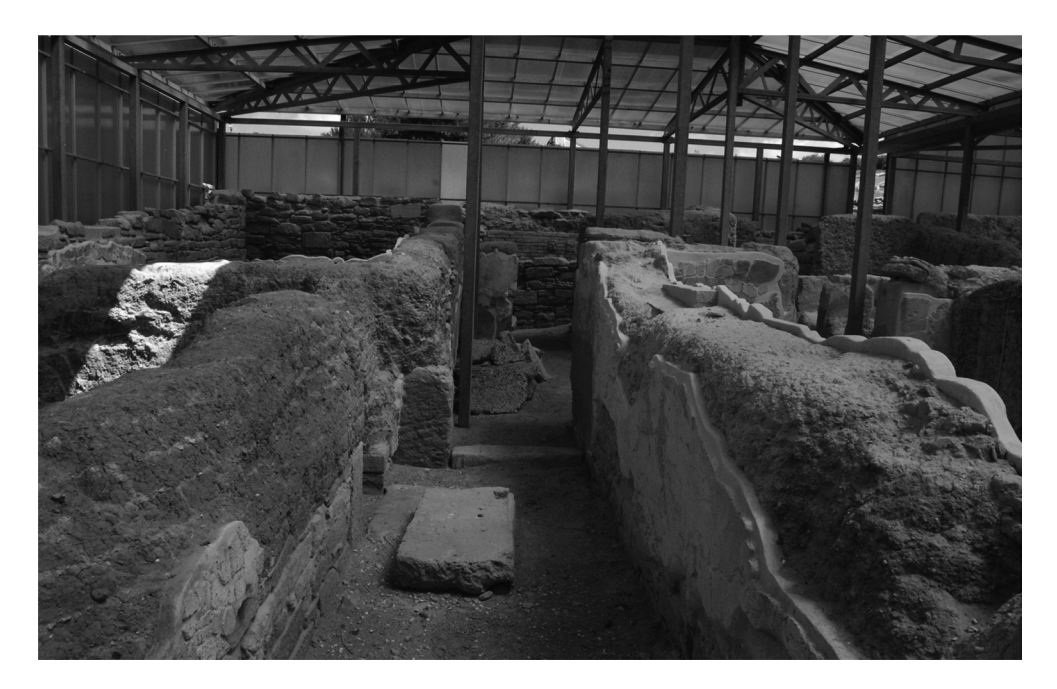
Figure 1. Eraclea Minoa (Agrigento). Domus, 2nd/1st century BC.

However there remains the question as to why there was a clean break with building technique such as adobe, which was also widely used all over the island until the Hellenistic-Roman period. This interrogative gathers strength from an observation from neighbouring Calabria, where the same tradition of earthen bricks in the archaeological field was subsequently carried on until the