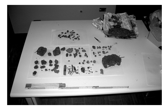
Figure 7. Aggregates found in the sample extracted in via Spinuzza a Cefalù.

The sample removed from via Spinuzza had a surprise in store: for nearly four centuries, the brick mixture had hidden a small head of a papier-maché Christ crucified (Fig. 8). This unexpected discovery was surprising because of its fortuity and there was consistency with radiocarbon dating. In fact, it is possible to link this find to one of the more evident effects of the Counter-Reformation, i.e. the accent placed on the educational purposes of Christian images and their consequent widespread diffusion among the lower social classes.