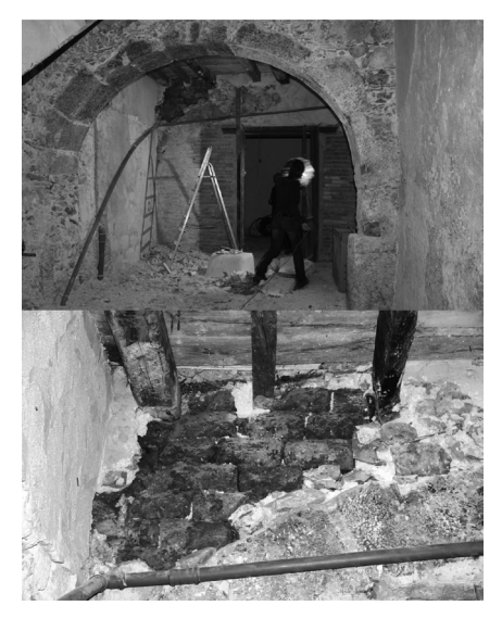
Figure 10. Filling made of earthen bricks over an arch, in a building in via Botta in Cefalù.