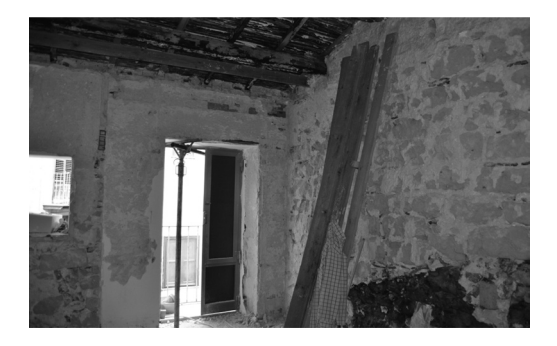
Figure 4. Third storey of a historical building in via Spinuzza a Cefalù; on the lower right, the wall in adobe.