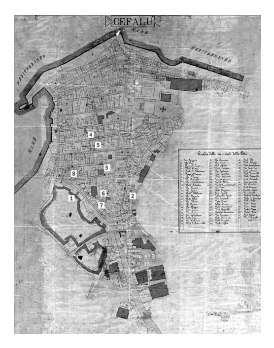
Figure 9. The town of Cefalù in a cadastral map dated 1850/60, reporting the finds of adobe traces.