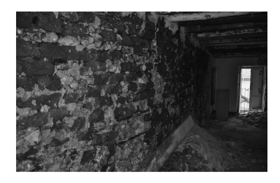
Figure 3. Wall in the second storey of a historical building in via Spinuzza in Cefalù.

of the three storeys of the building, which is made mainly in stone (Fig. 5). One might surmise that, in the absence of financial means, the adobe wall was built to meet the need for more space.