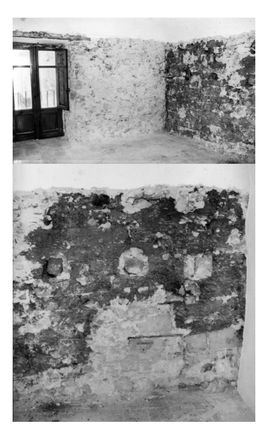
Figure 2. Inner wall in historical building in Cortile Rosariello, near S. Domenico (17th/18th cent. AD) in Cefalù. Photos dated 1995, found in Archivio Culotta in 2012.

The second circumstance occurred in 2010, during works aimed at creating bed & breakfast accommodation in an inconsequential building in the historical centre of Cefalù, when a wall in adobe was found by Mario Caliò and Monica Guercio, architects skilled in bio-architecture (Figs. 3–4). This wall stands in the second, and partly the third,