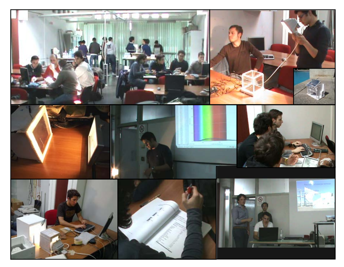
Figure 1. Collage of pictures taken during the work of the students involved in the OI-based learning environment dedicated to the pilot project "Mission to Mars".