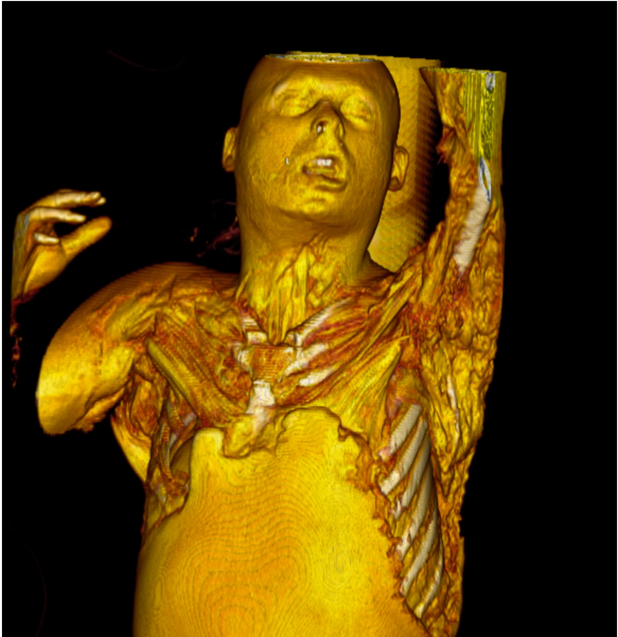
Fig. 2: Corpse 1: particular of Fig.1