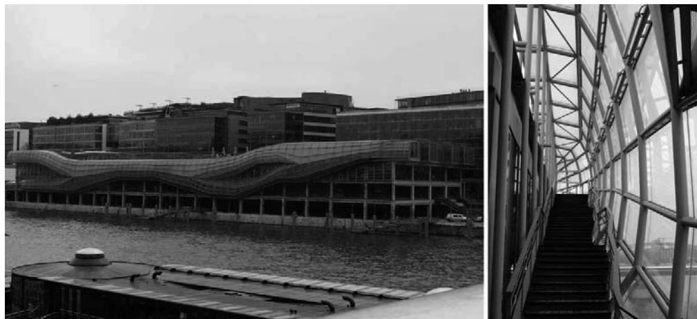
Figure 1: Cité de la Mode et du Design, Jakob+MacFarlane, Paris, 2005-2008.

envelope. They may indicate use of digital means to solve specific problems, e.g. represent complex geometries, or design actions constrained by the use of digital tools, e.g. frequent use of particular geometric primitives or operations. In many cases, the computer is used to facilitate representational and design actions, e.g. model complex surfaces that tend to be hard to specify by hand and may require more information than what is available in conventional orthographic projections. However, the choices and effects of digital means are presumably discernible in the design, but, upon closer inspection, it becomes evident that the main reason for recognizing digital elements in a design is the designers' or some critic's say-so.