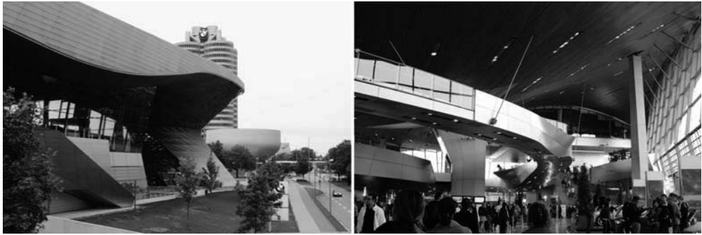
Figure 6: BMW Welt in Munich, Germany, Coop Himmelb(l)au.