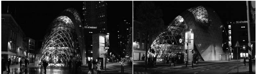
Figure 3: The Admirant Entrance Building in Eindhoven, The Netherlands, Massimiliano and Doriana Fuksas Architects.

We are confronted with a new style rather than just with a new set of techniques. [...] Avant-garde styles might be interpreted and evaluated in analogy to new scientific paradigms, affording a new conceptual framework, and formulating new aims, methods and values. (Schumacher 2009)