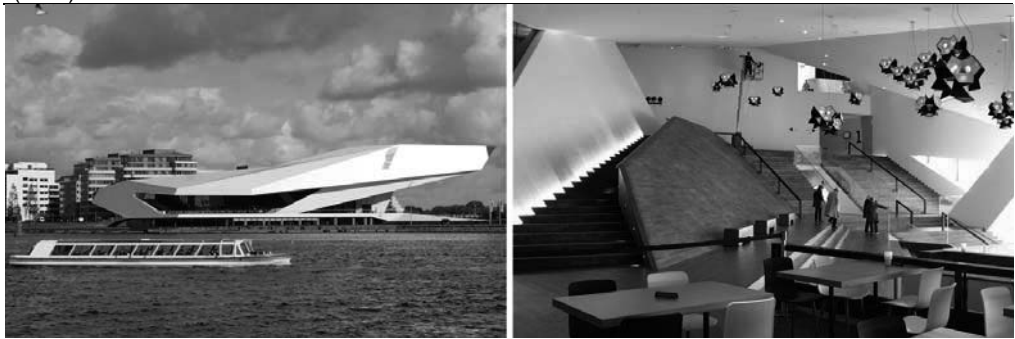
Figure 5: EYE Film Museum in Amsterdam, The Netherlands, Delugan Meissl Associated Architects.