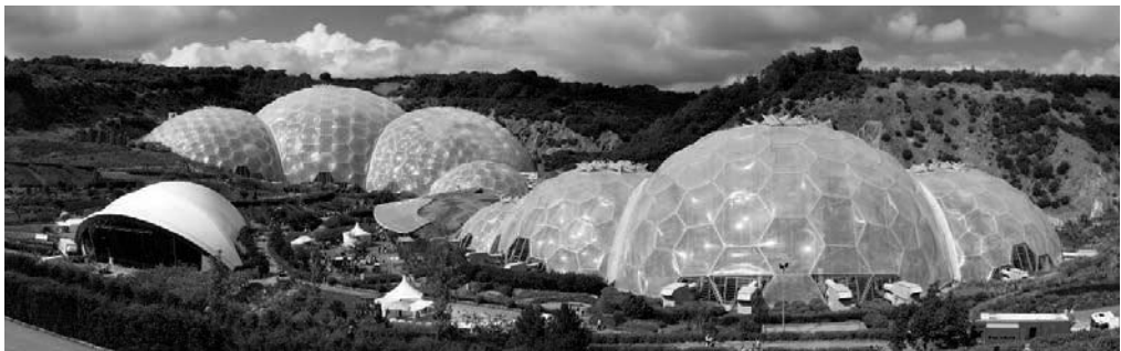
Figure 4: Eden Project in St Austell, Cornwall, England, Grimshaw Architects, 2001.