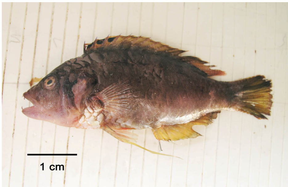
Figure 2. Pteragogus pelycus 130 mm TL (IIPB 20111014-01).