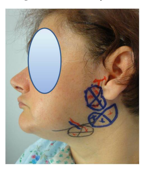
Figure 2. Sites of botox injections.

The injections of the submandibular glands are not really important because in the majority of cases these glands are to be removed during the neck dissection. The total quantity of the infiltrated toxin was 80–100 U for each patient [8].