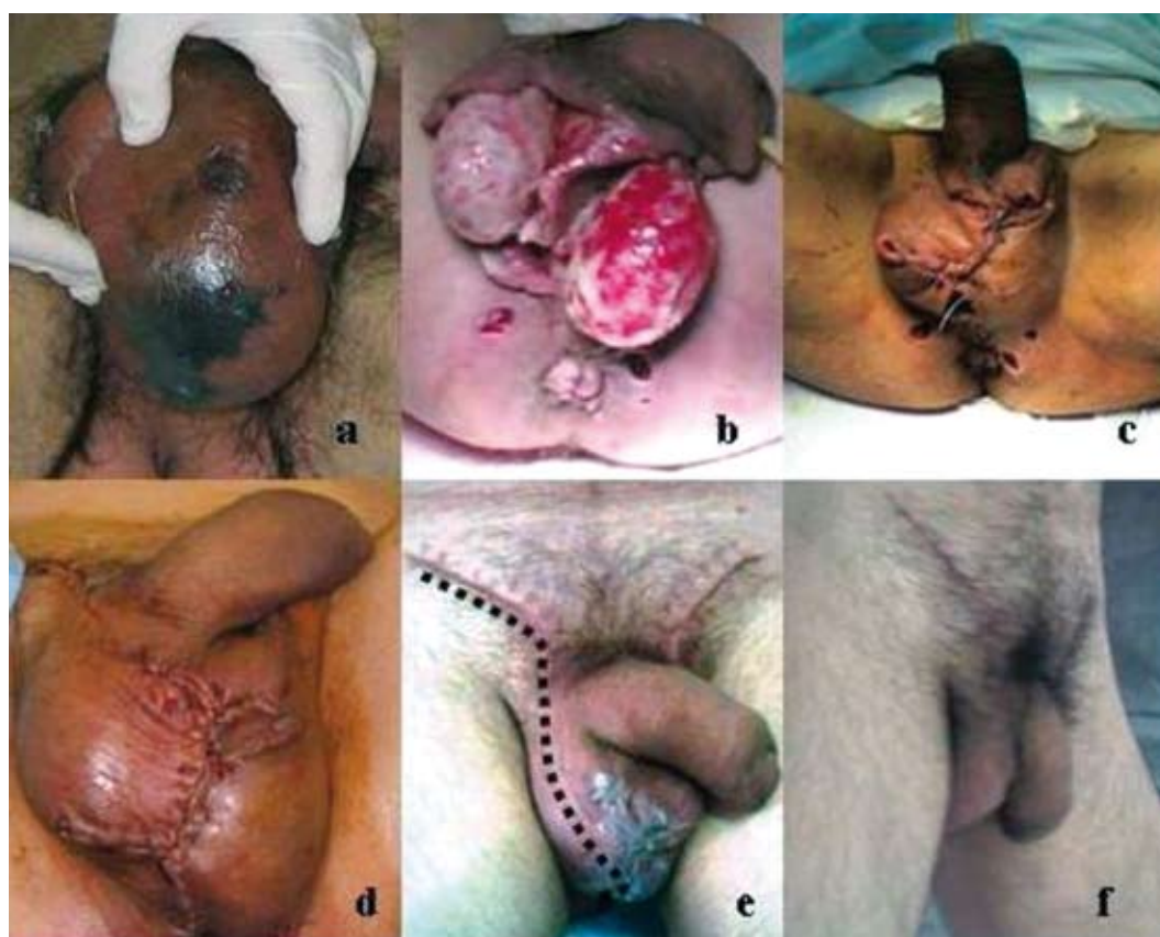
Fig. 1. Pre-surgical testes (a) and residual margins of scrotal skin (b). Enzymatic and mechanical debridement, package with soaked gauzes and skin margins temporarily grossly approached (c). Final scrotal suture after ten days. The skin is evidently stretched with disappearance of scrotal plications (d). Reconstructed scrotal bag two (e) and six months (f) from surgical treatment.

An acceptable cosmetic result was confirmed at two (Fig. 1e) and six months (Fig. 1f).