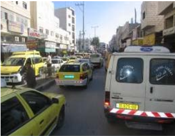
Fig. 4: Traffic jam in city center.