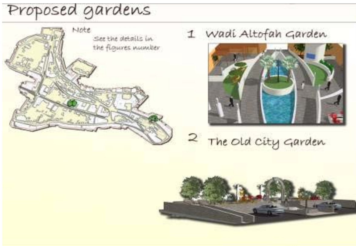
Fig. 9: Proposed Gardens.

The following guidelines - adopted from the book “public spaces” (Carr, 1995).- should be taken into consideration in designing open public spaces: