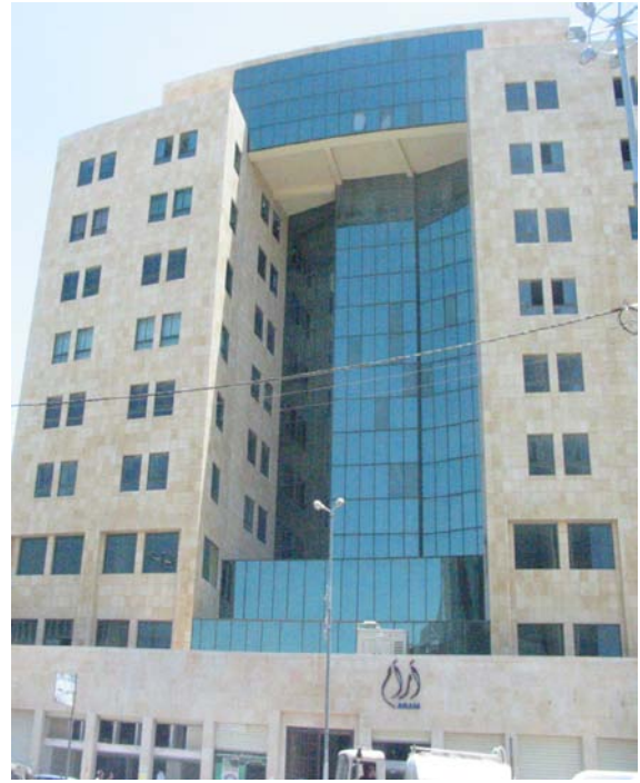
Fig. 7: Mixed use high rise building in city center.