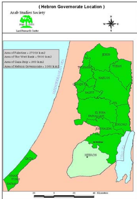
Fig. 1: Hebron in West Bank