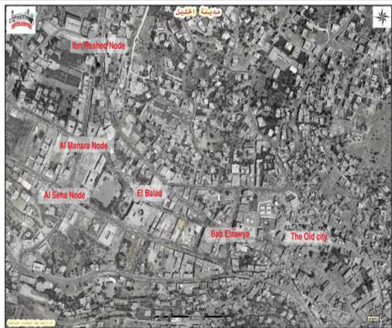
Fig. 2: Transmission of city center from the old city to West.

After Oslo agreement, the priority of the Palestinian Authority (P.A.) and Palestinian municipalities was constructing and rehabilitating the infrastructure of the Palestinian cities; water network, sanitation, paving streets, and constructing new schools and administrative institutions. Neglecting the development of new regulations for the cities and rehabilitating city centers. This led to chaos in Palestinian cities.