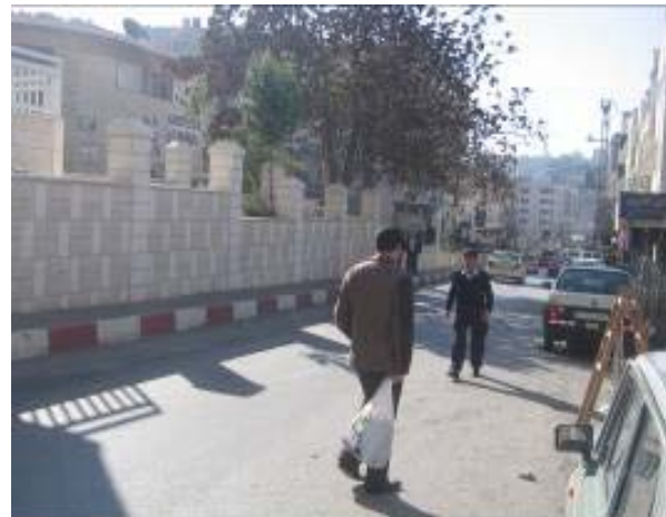
Fig. 5: People walking in the streets due to narrow sidewalks.