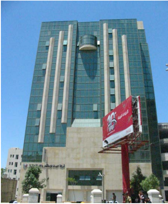
Fig. 6: High rise buildings in city center.