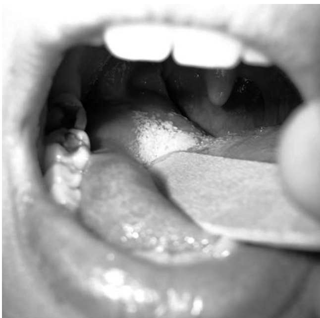
Fig. 4. Oral cavity examination six months after labour.

catheterization of the lingual artery on the left side was performed but, due to the effect of progesterone which causes smooth muscle relaxation and leads to AVM dilatation and rupture, the patient again presented haemoptysis, Hb was 6.7 g/dl with 20.2% of HCT and two units of blood were again given. Foetal growth, assessed by serial ultrasonography and sequential biophysical profile scores showed that the foetus was small for date; as pregnancy progressed, the patient's heart condition began to deteriorate and therefore since AVMs usually show spontaneous postpartum regression, and since in the opinion of the gynaecologists, after labour, the progesterone levels would decrease, the patient was given betamethasone to improve foetal lung maturation, and induction of labour was programmed for 26 weeks. Over the next few days, the patient had no further haemoptysis; after six months, angiographic examination were again performed which