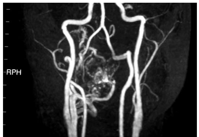
Fig. 2. Angio CT showing original AVM.