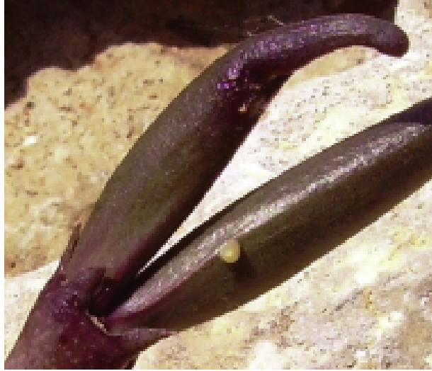
Fig. 4 — Egg of D. chrysippus on the follicle of C. europaea photographed in the field.

est ones look greyish. It forms large clumps up to 15-20 cm in diameter. Flowers are red-brown with yellow stripes or streaks, 10-15 mm in diameter. The corona is normally purplish (Fig. 5) (SAJEVA & COSTANZO, 1994). Fruits are follicles that at maturity dry out. Plants growing in rock crevices usually have a central erect stem and many smaller ones more or less procumbent, while