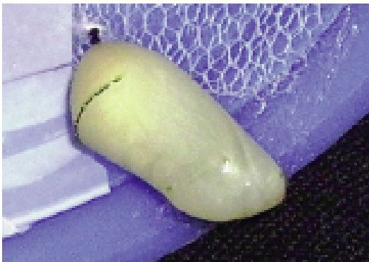
Fig. 3 — Pupa of D. chrysippus from eggs collected in Lampedusa and reared in laboratory.

dealing with the ecology and taxonomy of the family (e.g. ALBERS & MEVE, 2002) still recognise and use Asclepiadaceae as a valid family. In this paper Asclepiadaceae are being treated as a family, in accordance with ALBERS & MEVE (2002), and OLLERTON (2003). C. europaea has quadrangular stems, the younger ones are green and have small leaves that soon wither while the old-