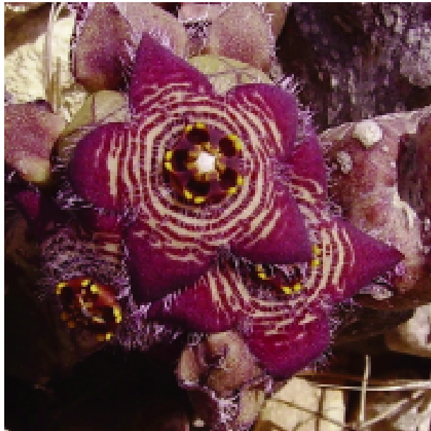
Fig. 5 — Flowers of C. europaea.

est ones look greyish. It forms large clumps up to 15-20 cm in diameter. Flowers are red-brown with yellow stripes or streaks, 10-15 mm in diameter. The corona is normally purplish (Fig. 5) (SAJEVA & COSTANZO, 1994). Fruits are follicles that at maturity dry out. Plants growing in rock crevices usually have a central erect stem and many smaller ones more or less procumbent, while