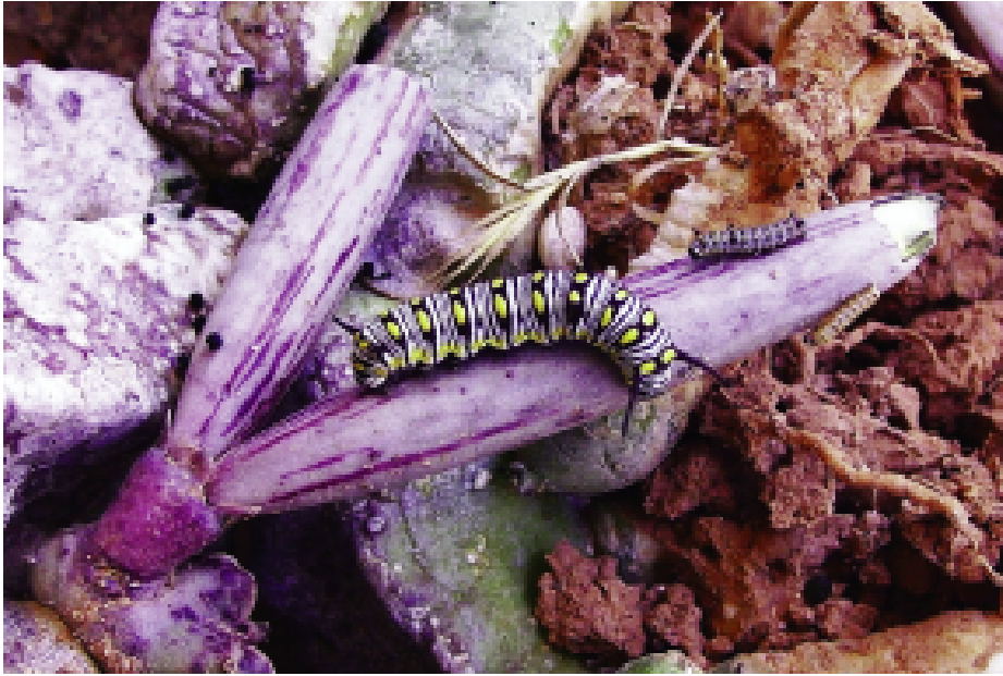
Fig. 8 — Caterpillars of D. chrysippus feeding on follicles of C. europaea ..

Plumbaginaceae. Among Asclepiadaceae the following taxa have been reported as host plants for larvae of D. chrysippus : Asclepias , Aspidoglossum , Brachystelma , Calotropis , Caralluma , Ceropegia , Cynanchum , Gomphocarpus , Huernia , Ischnostemma , Kanabia , Leichardtia , Leptadenia , Marsdenia , Metaplexis , Pachycarpus , Pentarrhinum , Pentatropis , Pergularia , Periploca , Pleurostelma , Raphistemma , Rhyncharrhena , Sarcostemma , Schizoglossum , Secamone , Stapelia , Stathmostelma , Tylophora (ACKERY & VANE-WRIGHT, 1984; VANE-WRIGHT & DE JONG, 2003). Within the genus Caralluma , only C. burchardii (BRANDES, 2005) has been recorded at specific level as forage plant for D. chrysippus . Our record is the first for the species C. europaea as fodder for D. chrysippus .