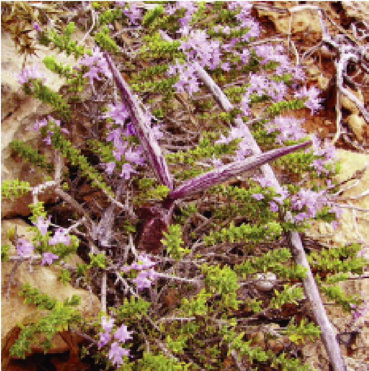
Fig. 7 — C. europaea and T. capitatus in Lampedusa Island.

Five larvae and five eggs have been collected monthly to observe the feeding behaviour. Eggs and larvae were reared in plastic boxes placed in a thermostated room at 25 \pm 2 °C illuminated with 100 \mu\text{mol m}^{-2} flux and a photoperiod of 16/8 light/dark hours. To study food preference, as source of food they were supplied with stems, follicles or stem with follicles of C. europaea collected in Lampedusa and cultivated at the Botanical Garden of Palermo. The process of complete metamorphosis of D. chrysippus has been observed in controlled conditions. After the emergence, the adults were mounted and stored in entomological boxes at the Dipartimento di Scienze Botaniche.