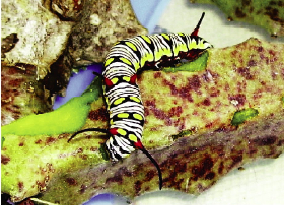
Fig. 2 — Larva of D. chrysippus feeding on stem of C. europaea under laboratory condition.

dealing with the ecology and taxonomy of the family (e.g. ALBERS & MEVE, 2002) still recognise and use Asclepiadaceae as a valid family. In this paper Asclepiadaceae are being treated as a family, in accordance with ALBERS & MEVE (2002), and OLLERTON (2003). C. europaea has quadrangular stems, the younger ones are green and have small leaves that soon wither while the old-