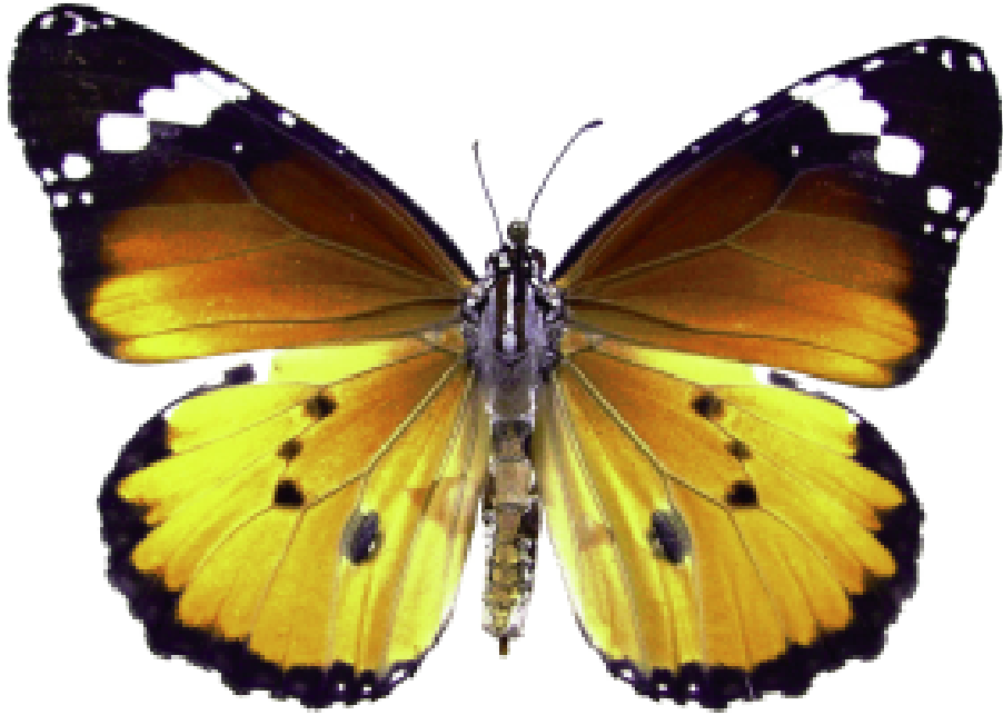
Fig. 1 — Specimen of Danaus chrysippus from pupa reared in laboratory.

volatile dihydropyrrolizines, some of which may play a specific role in courtship behaviour (FRANCKE, 1989).