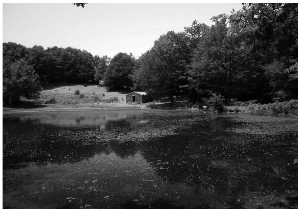
Fig. 2 – Panoramic view of the “Sollazzo Verde” pond, in The Nebrodi Mountains (Sicily).