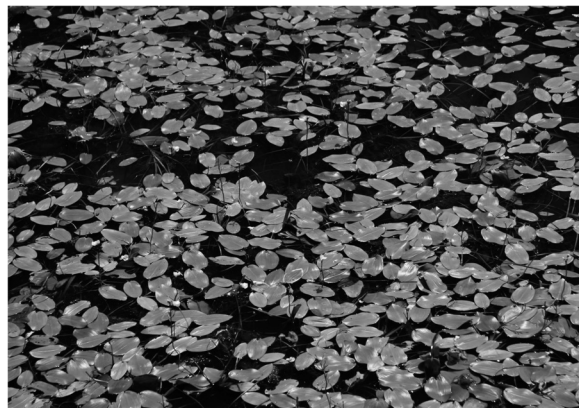
Fig. 5 – Detail of the Utriculario-Potametum natantis in the Nebrodi ponds.

spicata , Callitriche stagnalis and Apium inundatum are important.