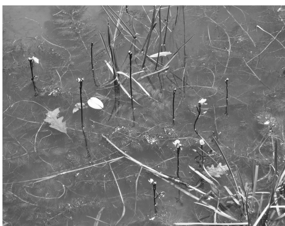
Fig. 4 – Flowering of Utricularia vulgaris in the “Sollazzo Verde” pond.