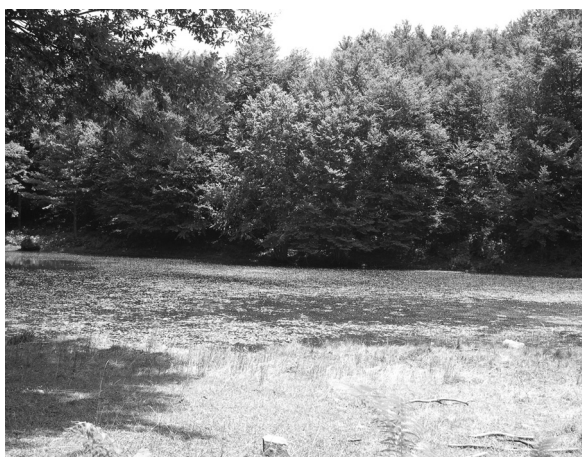
Fig. 3 – Panoramic view of the “Pappanu” pond, in the Nebrodi Mountains (Sicily).