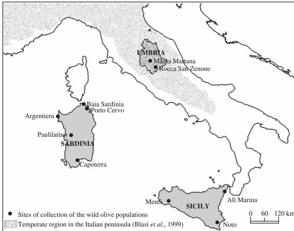
FIG. 1. Map of the sites where oleaster populations were collected. The regions under study are shown in grey. The temperate region is distinguished from the Mediterranean region by grainy shading.

been evaluated. The identification of genetically homogeneous groups of individuals has been reached by the implementation of STRUCTURE software (Pritchard et al. , 2000), and with amplified fragment length polymorphism (AFLP) dominant markers (Angiolillo et al. , 1999; Sanz-Cortes et al. , 2003; Sensi et al. , 2003; Owen et al. , 2005), which has been shown to give results as accurate as microsatellites in such analyses (Evanno et al. , 2005).