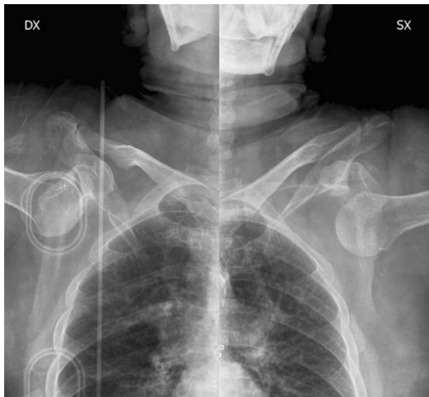
Fig. 1 Bilateral luxatio erecta