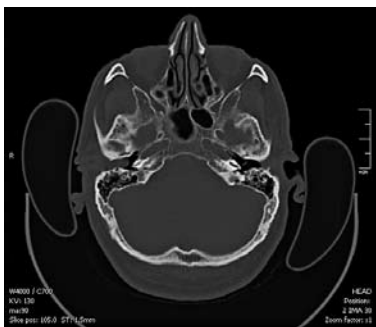
Fig. 1. Axial computed tomography, without contrast media, showing a mass lateral to the tympanic membrane filling the right external auditory canal.

Under general anaesthesia, this lesion was smoothly excised, under an otomicroscope, by an endo-aural approach. The mass, based on the postero-inferior portion of the bony canal, was excised en bloc by elevating the skin in continuity with the lesion from the canal without entering the middle ear space; the bone of the EAC was normal in appearance. Bleeding was controlled with cautery.