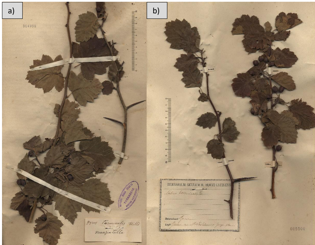
Fig. 1 - Scanned images of the herbarium sheets holding the specimens. / Scansioni dei fogli d'erbario con gli esemplari. a) CAT004998 (Erbario Tornabene, https://www.parcokentie.it/herbarium/foto/06/004998.jpg ); b) CAT005000 (Erbario Tornabene, https://www.parcokentie.it/herbarium/foto/06/005000.jpg ).

The second specimen (CAT005000, Fig. 1b) was collected by Pasquale Baccarini in June 1892, i.e., during his stay at Catania as chair of the Institute of Botany, and comes from Misterbianco, whose municipality currently ranges from 21 m to 329 m a.s.l. Fig. 2 shows the location of both sampling sites. Tornabene did not mention the presence of S. tormalis on Mount Etna; this leads us to assume that also the first sample was collected after the publication of his main works (Tornabene, 1887, 1890). As with Baccarini, he did not mention them in any of his publications, probably because he was unsure about their identification.