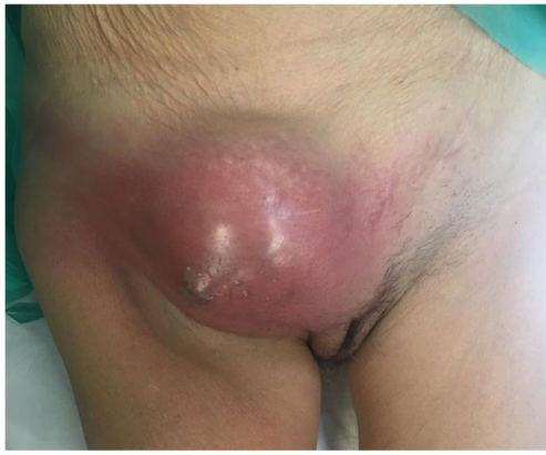
Fig. 1 De Garengeot's hernia

The CT scan of the abdomen (Fig. 2) revealed the herniation of the appendix in the femoral hernia sac. The patient received intravenous fluids and antibiotics (500 mg of metronidazole and 1 g of cefazolin); the surgical operation was proposed.