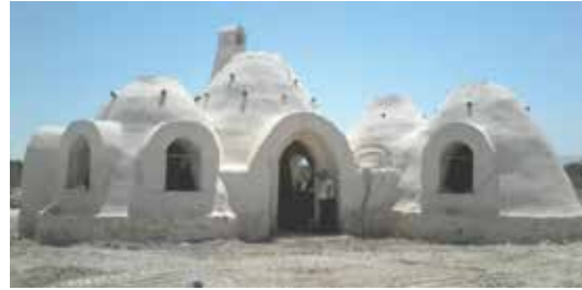
Figure 1. Mud house in Jericho by Shams-Ard group