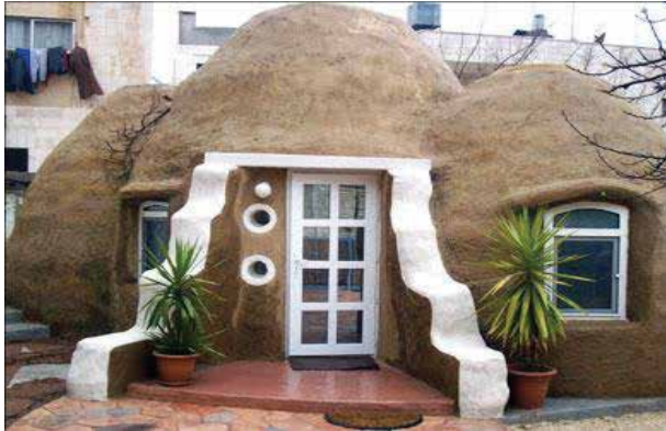
Figure 3. Earthen house in Jordan by Jana Khalili

Other architects also assures these problems facing the building sector. But all of these personal or organizational efforts must be followed by intensive public efforts to achieve a group of guidelines for the future of the region.