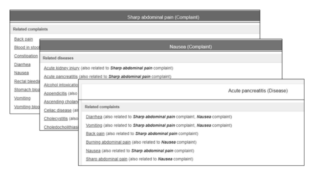
Fig. 4. Related complaints and diseases are ordered by considering their correlation with the previous searched elements.

When a related complaint, disease or test is selected a new information window is opened, which displays related complaints, diseases and tests ordered by taking into account the previous searches (Fig. 4).