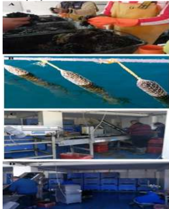
Fig.1. Seed insertion (A), mollusks rests immersed into water (B). Mollusks selection and processing with conveyor belt (C) and shellfish purification in tanks with water jets (D).

The bivalve mollusks production chain requires a quite laborious and complex process, which generally lasts from 8 to 12 months. Some phases of the production chain are shown in figure 1. The process starts with the breeding or harvesting of the different species in the production areas (figure 1A). These can be part of the sea, lagoon or estuary, where there are natural banks of bivalve mollusks or places used for their cultivation.