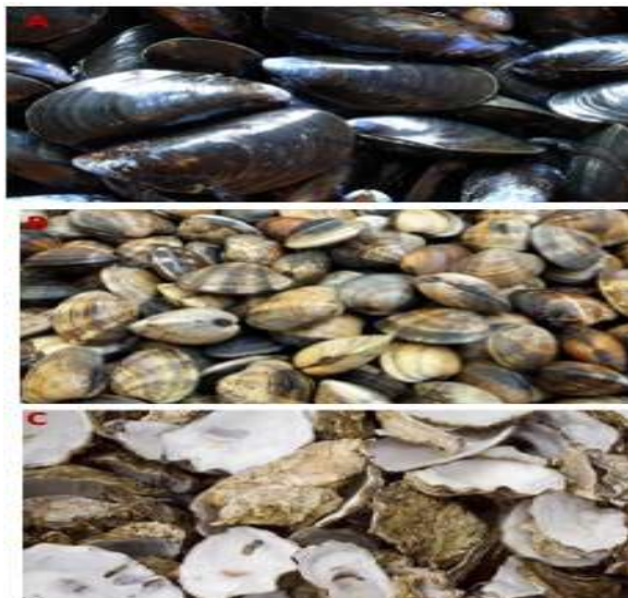
Fig. 2. Types of most European traded bivalve mollusks: mussels (A), clams (B) and oysters (C).

which supplied 85% of world production in 2019. Other major global producers include, to a lesser extent, Republic of Korea and the United States of America [15]. Mollusks are an important resource for the marine food chain and have a significant impact on the marine environment because they are "filtering" animals. Indeed, they assimilate the food dissolved in the water through siphons, which with internal and external movement effectively filter the waters they live in. As a result, the waters are continuously purified through this filtering process. Hence, mollusks actively contribute to the marine environment general health. The class of bivalves belongs to the phylum Mutili, so named for the presence of two valves, connected by an elastic ligament located on the dorsal margin of the shell, that are made of calcareous materials, mainly calcium carbonate, which surround the animal's body. Most bivalves live near the seashore, although there are some species that live in the depths of the ocean, even reaching more than 5,000 m in depth. The bivalves, therefore, persist on the bottom and in the substrate of fresh lakes or river waters, giving rise to dense populations [16]. In the following sections, the mussels, clams and oysters' markets are examined, with data reported for the main producing countries; therefore, figures 3 A-B-C show the production trend respectively for Spain, Italy and France.