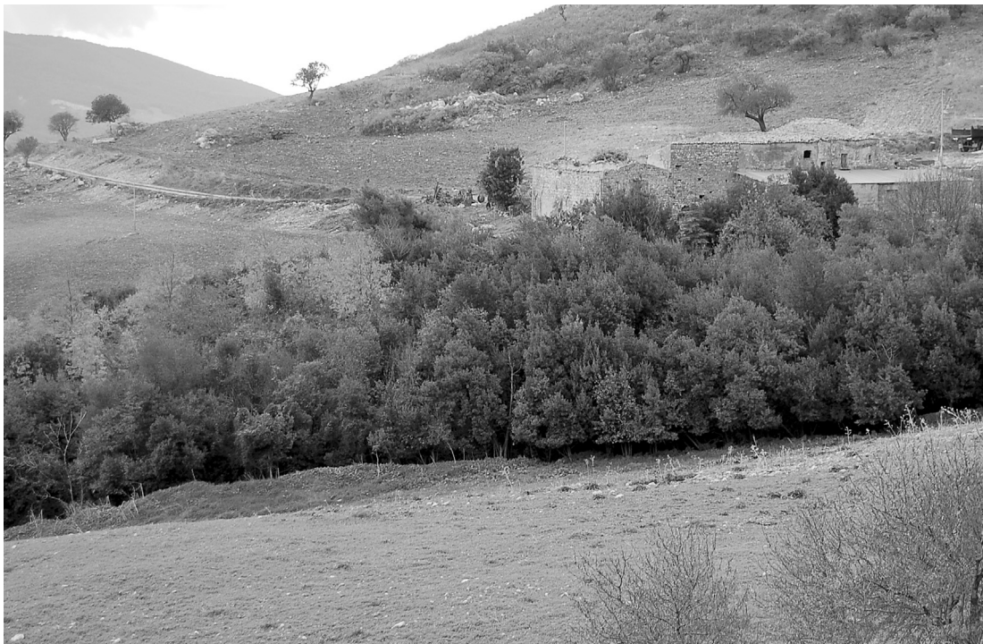
Figure 3.— Laurus nobilis woodland in "Monte Genuardo and S. Maria del Bosco Nature Reserve" (Sambuca di Sicilia).

This vegetation is located in the Sicani mountains, and particularly in Sambuca di Sicilia (Contrada Menta) and Bivona (Torrente Alba). The first of these is included in Monte Genuardo and the Santa Maria del Bosco Nature Reserve, where one of the patches extends for almost one hectare (Figure 3). The second refers to another consistent laurel community extending for 6000 m 2 , locally known as "Viale degli Allori" (Laurel Avenue), which refers to dense and intricate vegetation located along a stream. In both cases these are residual woodlands with large polycormic L. nobilis individuals, 12-14 metres in height, fortunately saved from the intense transformation of the territory. Considering the singularity, rarity and environmental-naturalistic importance of the coenosis, these sites should be given more appropriate protection, starting with the sites not included in protected areas.