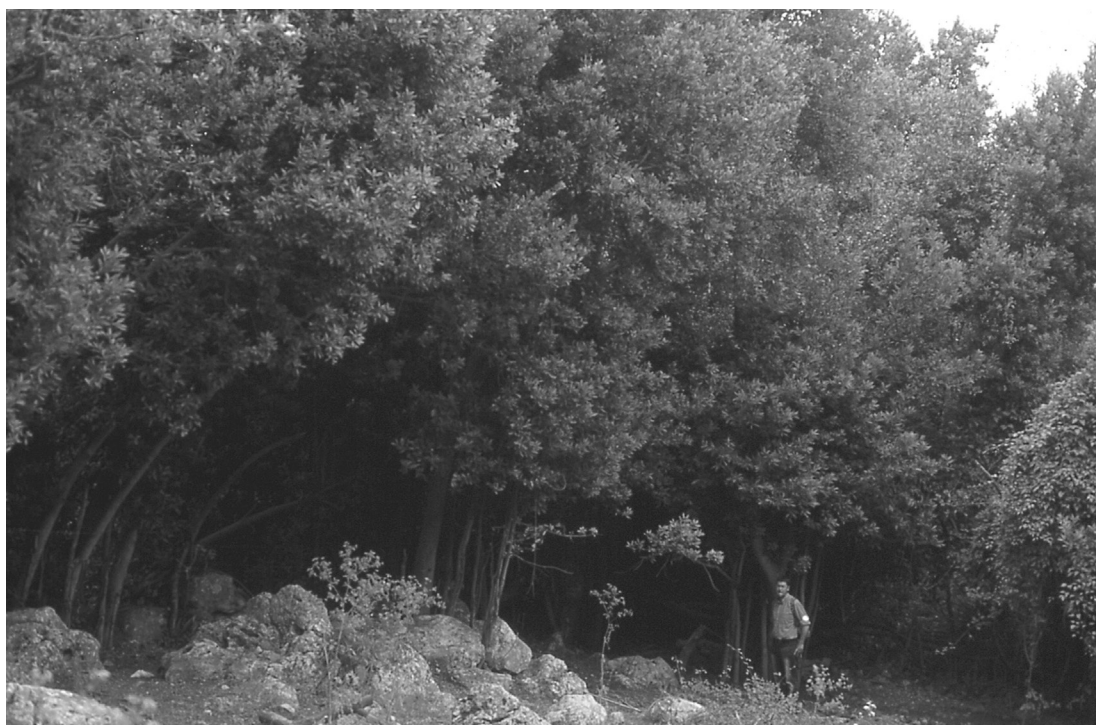
Figure 4.— Aspects of Acantho mollis-Lauretum nobilis in the Sicani mountains.

The recognition of the Acantho mollis-Lauretum nobilis in Sicily is of particular phytogeographic interest, as well as having certain naturalistic-environmental value. The association interpreted as a southern vicariant of other coeno-