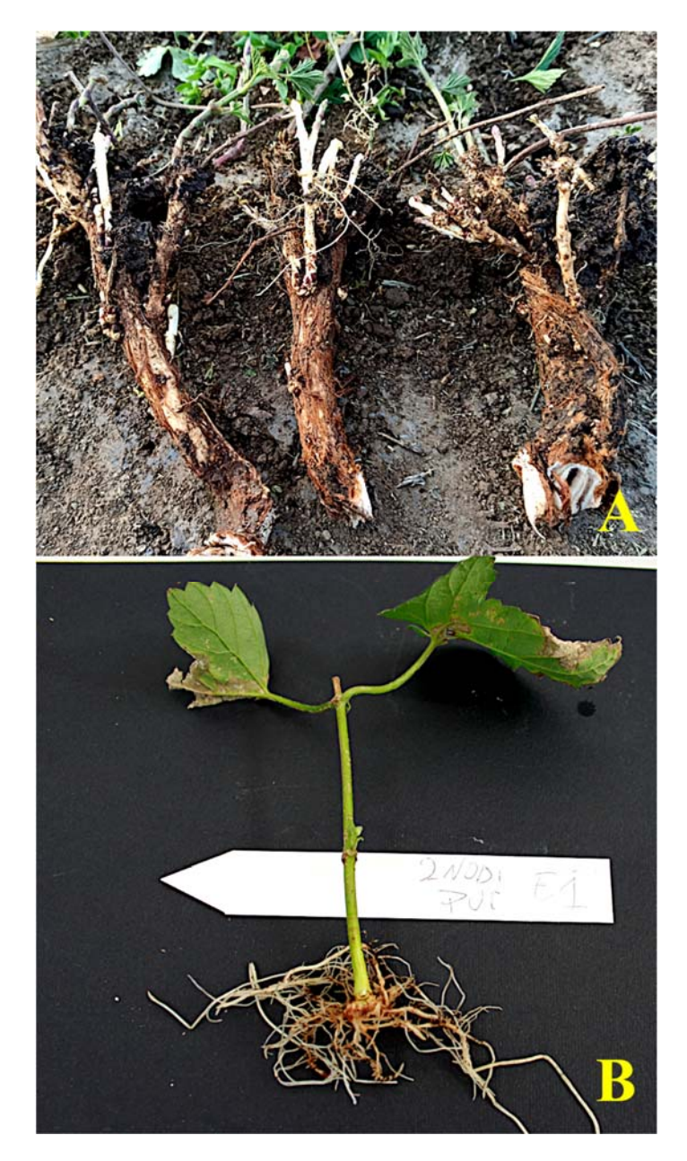
Figure 4. Vegetative propagation of hops: (A) rhizomes; (B) rooted cutting.