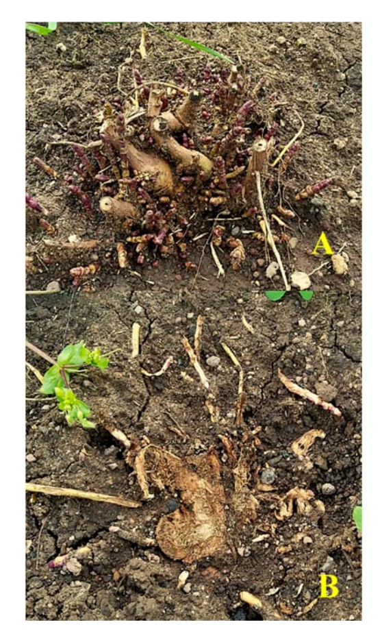
Figure 5. Hop pruning: (A) not pruned rootstock; (B) pruned rootstock.

rootstock [63,77]. It was suggested that, depending on timing and severity of pruning, growers could eliminate one fungicide application per year [78]. Specifically, a four-week delayed pruning can significantly reduce powdery mildew incidence on leaves and cones [79]. Moreover, combining the mechanical and chemical intervention generally leads to a more thorough effect compared with the application of a single method [78,79]. In new growing areas, no herbicide is currently registered for this purpose, as such, mechanical pruning is the only option available.