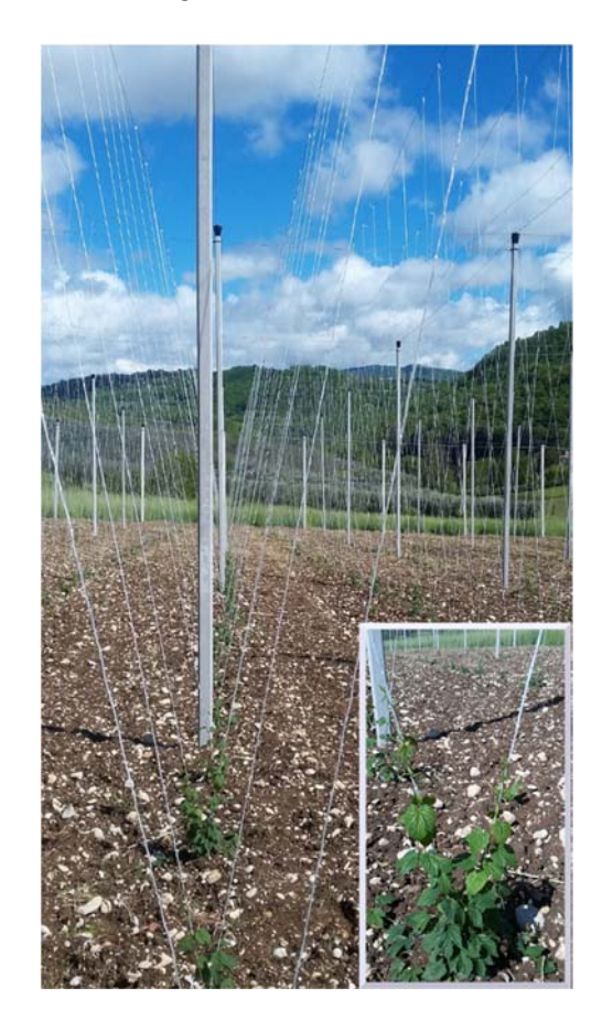
Figure 3. V-trellis system.

Commercial hop production requires a trellising system to support plants. The conventional high trellising system consists of a permanent structure of poles and wire to which strings are attached each year to provide support for the hop bines [2]. Poles can be made of treated wood, iron, steel, or concrete. Pre-stressed concrete poles are much more expensive than wood ones, but they better withstand mechanical stress. Growers should be informed that the trellis is an engineered structure subject to heavy loads, including the plant (heavier when wet) and wind. The top height of such structures can vary, but usually ranges from 5 m to 8 m. The most common training system used for hop production worldwide is the V-trellis (Figure 3), and the same is also used in the Mediterranean region [14,65].