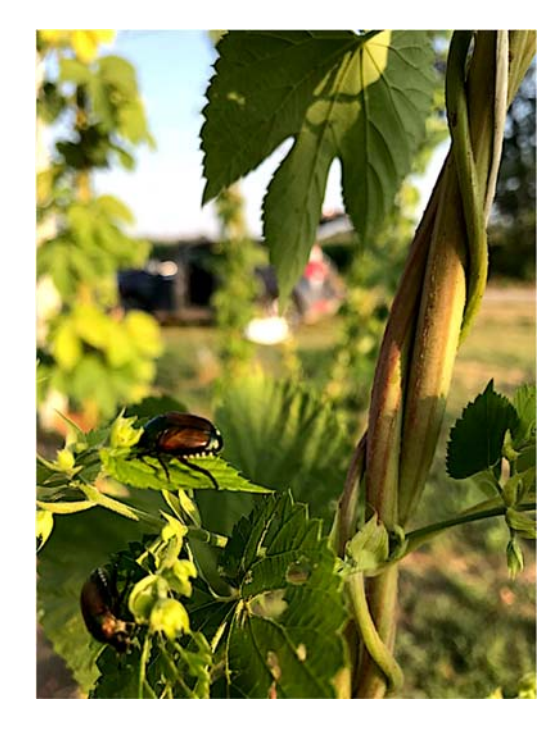
Figure 6. Japanese beetles (Popillia japonica Newman) feeding on hops.

plants was recorded in the period July–August 2019, and it was deleterious (Figure 6). Japanese beetle fed on the hop leaves, significantly reducing the photosynthetic activity of the plants. It seemed they were not interested in feeding on the flowers, but this was only an observation. Since the Japanese beetle is an alien species for our territory, the control of this pest is rather complicated. Solutions could involve agronomic practices applied to the meadows where the larvae overwinter, and the registration of pesticides (for organic and conventional farming) before this insect becomes a real emergency.