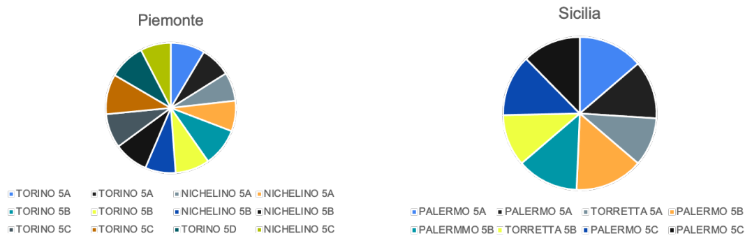
Figure 1 Classes distribution for Sicilia and Piemonte

The participants were drawn from schools in both the provinces of Turin and Palermo, ensuring an equal distribution between the two regions.