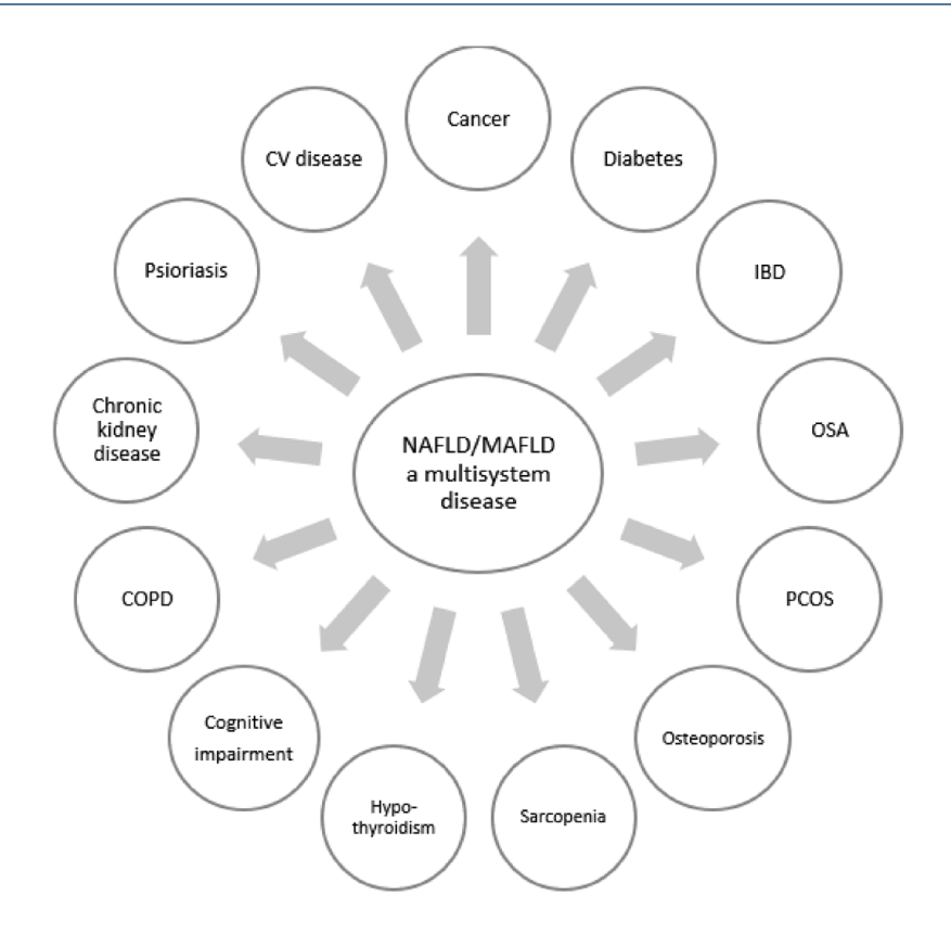
Figure 3. Summary of the major extrahepatic complications of NAFLD/MAFLD. NAFLD/MAFLD could be framed as a multisystemic disease. Sharing metabolic comorbidities, genetic background, and the severity of liver disease can modulate the risk of extrahepatic complications, even if the key question is whether NAFLD/MAFLD per se, via proinflammatory and profibrogenic pathways, is a real risk factor or it is only a surrogate of aging and of different metabolic and inflammatory risk factors. The mechanisms underlying these associations and their long-term clinical meaning need to be further investigated.

microorganism-associated patterns (MAMPs) promoting tumorigenesis through increased IL-6 signaling that protects cells from apoptosis induction.<sup>80</sup>