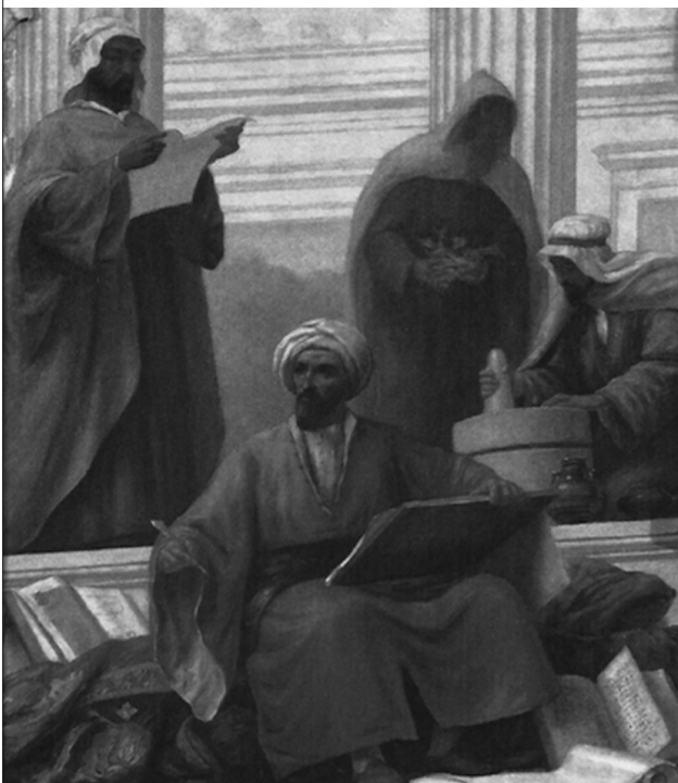
Fig. 2. Bahā'al-Dawlah Razi, original image from: https://www.mizajresearch.com/history-of-medicine/baha-al-dawlah-razi/ .

While the origins of pertussis remain, as described above, uncertain, there is absolutely no question that the disease took to reaping victims at an ever-increasing rate.