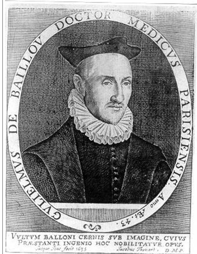
Fig. 1. Guillaume de Baillou.

Despite these brilliant epidemiological and symptomatological observations, de Baillou was unable