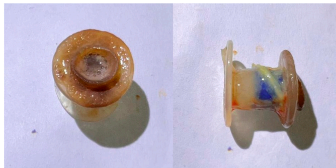
Figure 1. Macroscopic views of a colonized VP.

No significant variations were found in the laboratory tests, especially concerning the leukocyte count. Figure 1 shows macroscopic views of a colonized VP.