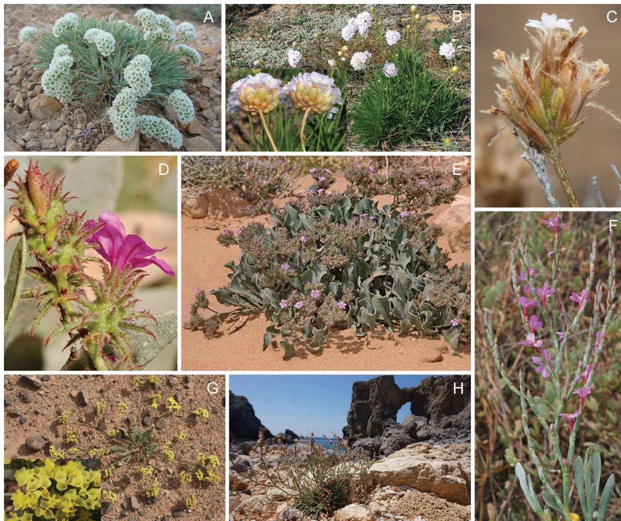
Figure 1. Morphological and habitat diversity in the family Plumbaginaceae. Limonieae: A Acantholimon pterostegium Bunge B Armeria pungens (Brot.) Hoffmanns. & Link C Bakerolimon plumosum (Phil.) Lincz. D Ceratolimon feei (Girard) M.B.Crespo & Lledó E Ceratolimon weygandiorum (Maire & Wilczek) M.B.Crespo & Lledó F Limoniastrum monopetalum (L.) Boiss. G Limonium bonduellei (T.Lestib.) Kuntze H Limonium virgatum (Willd.) Fourr.

number of species previously known for the country by describing many new apomictic polyploid morphospecies.