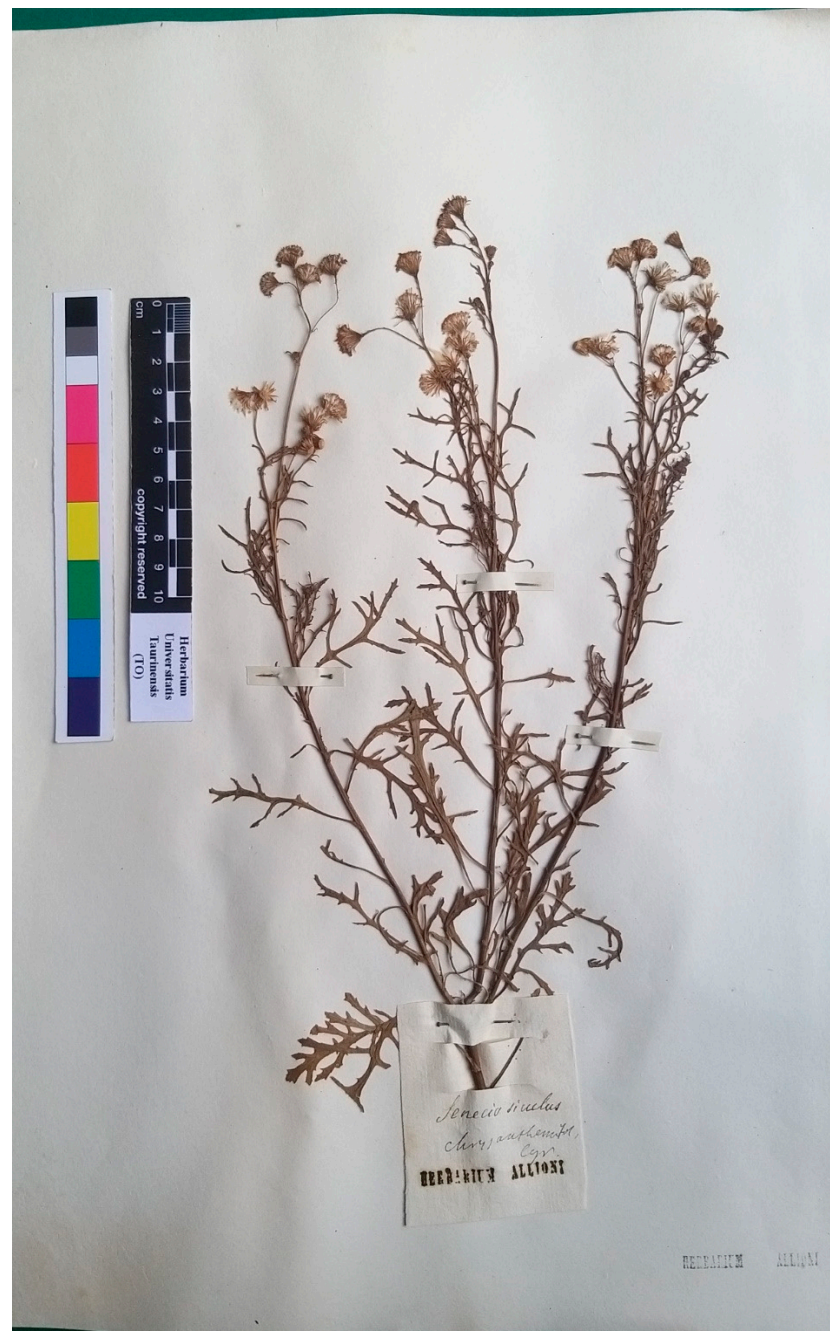
Figure 6. The specimen conserved in the Herbarium Allioni, TO, here designated as lectotype of the name Senecio siculus All. (photo reproduced with permission).

Type (lectotype here designated): [Sicily] Senecio siculus , chrysanthemifol. Cyr. (TO ex Herb. Allioni [digital photo!]) (Figure 6).