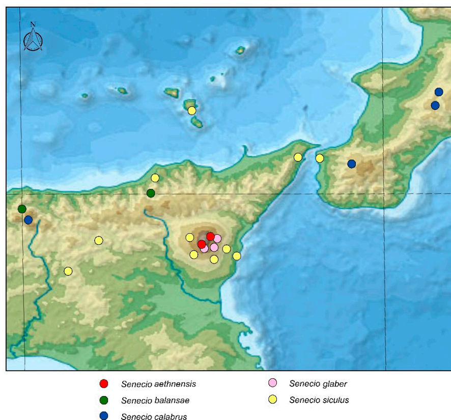
Figure 2. Detailed distribution map of the five species occurring across eastern Sicily and southern Calabria according to the studied herbarium specimens.