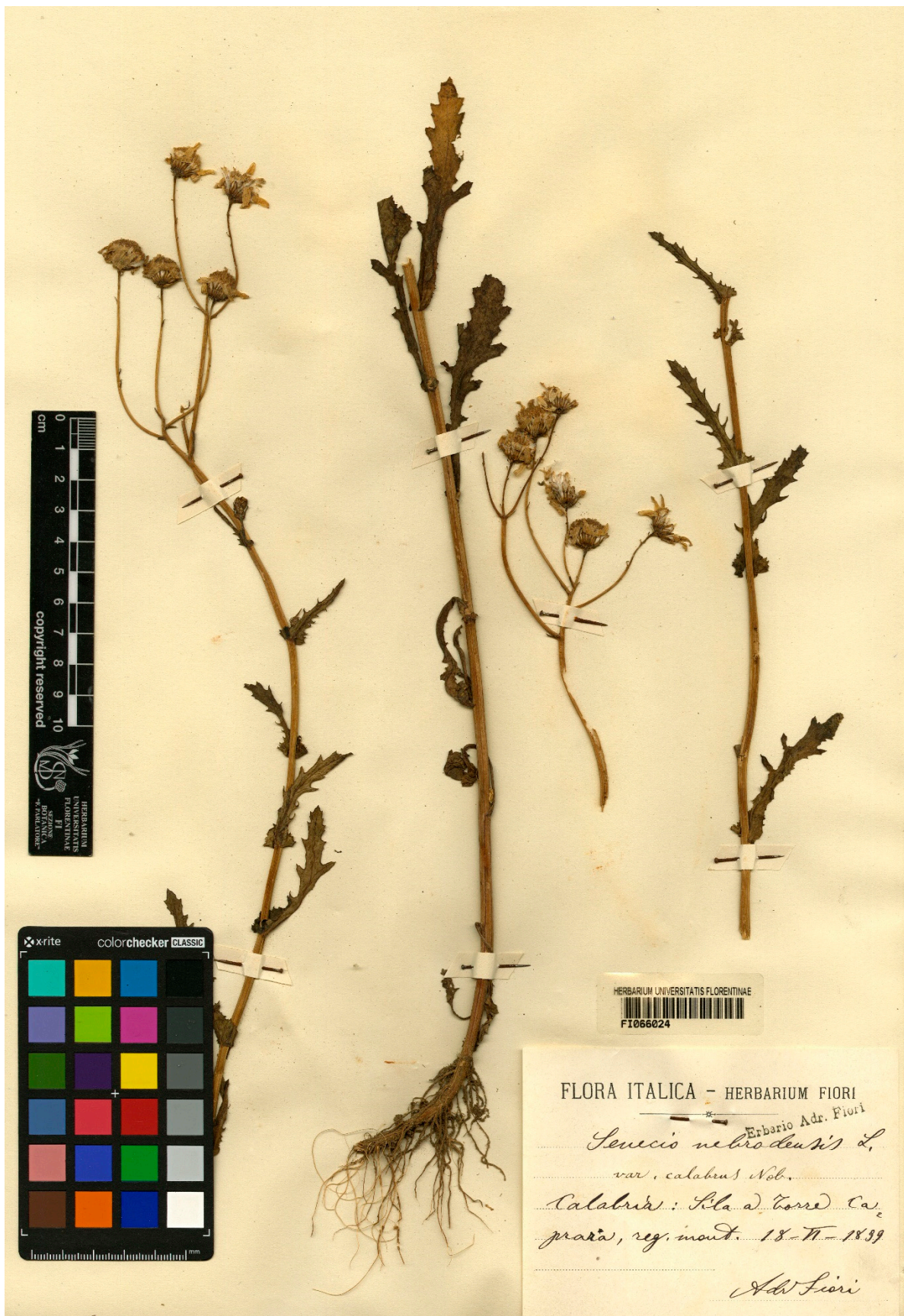
Figure 5. The specimen FI066024 collected by Adriano Fiori and here designated as lectotype of the name Senecio nebrodensis var. calabrus Fiori (photo reproduced with permission).