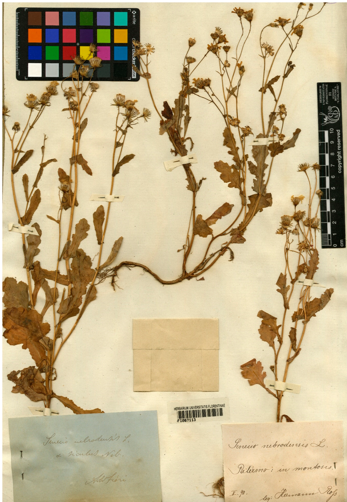
Figure 4. The specimen FI067113 collected by Hermann Ross and revised by Adriano Fiori, here designated as lectotype of the name Senecio nebrodensis var. siculus Fiori (photo reproduced with permission).