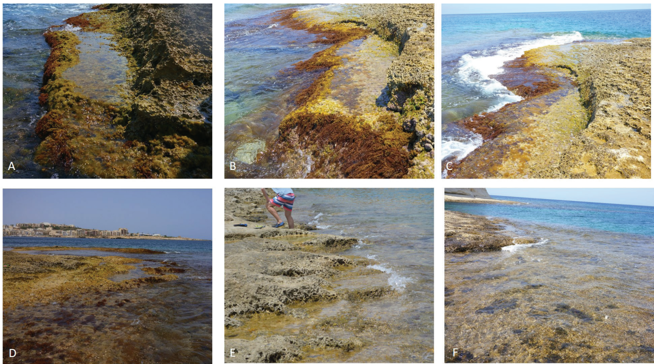
Fig. 2: Photos of the vermetid typology trotoir recorded at sites 6 “Malta Film Studios” (A), 7 “Dawrett x-Xatt” (B), 8 “Żonqor” (C) and 9 “Jerma” (D), crust at sites 10 “Kalanka” (E) and 19 “Marsalforn” (F).

On Gozo, vermetid bioconstructions were recorded at six sites, specifically at “Xatt l-Aħmar”, “Dwejra”, “Reqqa”, “Marsalforn”, “Dahlet Qorrot” and “Xwejni Beach” (Fig. 1). “Marsalforn” was the only Gozitan coastal site selected for further qualitative measurement and quantitative analysis. At the northeast extremity of Marsalforn Bay, an abrasion platform colonized by crusts of vermetids was recorded, extending over a maximum width of 7 meters and being subjected to seasonal trampling disturbance due to its popularity for bathing (Fig. 2F).