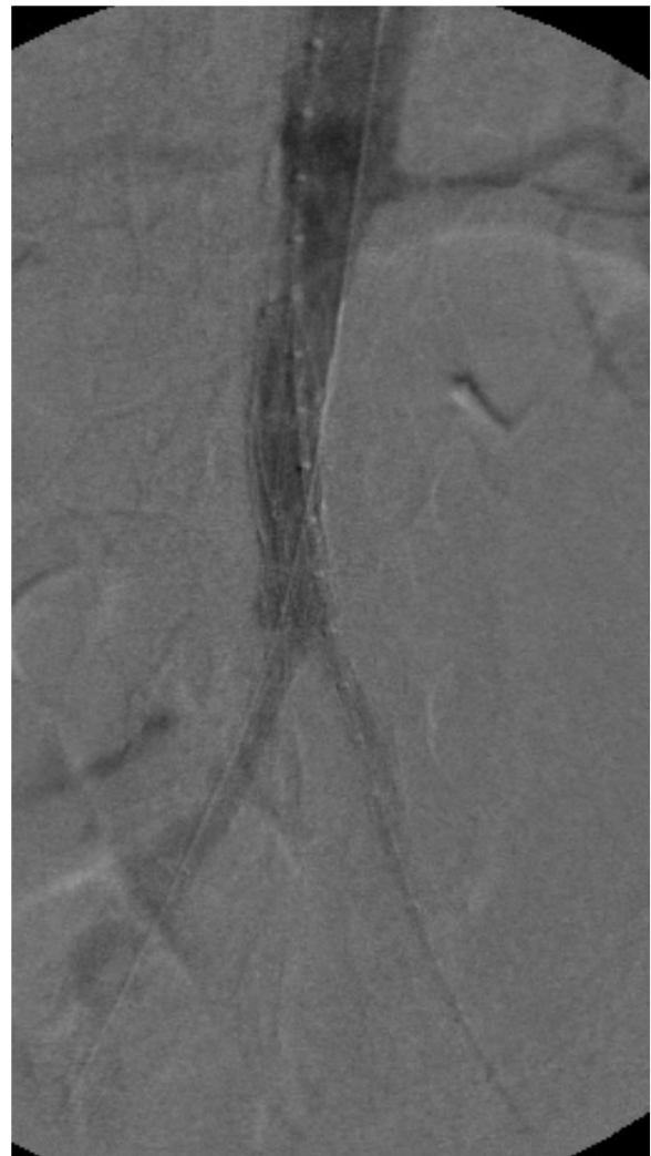
Fig. 3. Completion intraoperative angiography showing the correct positioning and patency of the aortic stent-graft.

with narrowing residual lumen and monophasic wave on both iliac-femoral axes. CT angiography confirmed the atherosclerotic disease in the aortic carrefour with local dissection and significant stenosis on both origins of common iliac arteries (Fig. 1); furthermore, superficial femoral arteries were bilaterally occluded and non-significant stenosis in correspondence of both popliteal arteries (Fig. 2). A significant left renal artery stenosis was also reported.