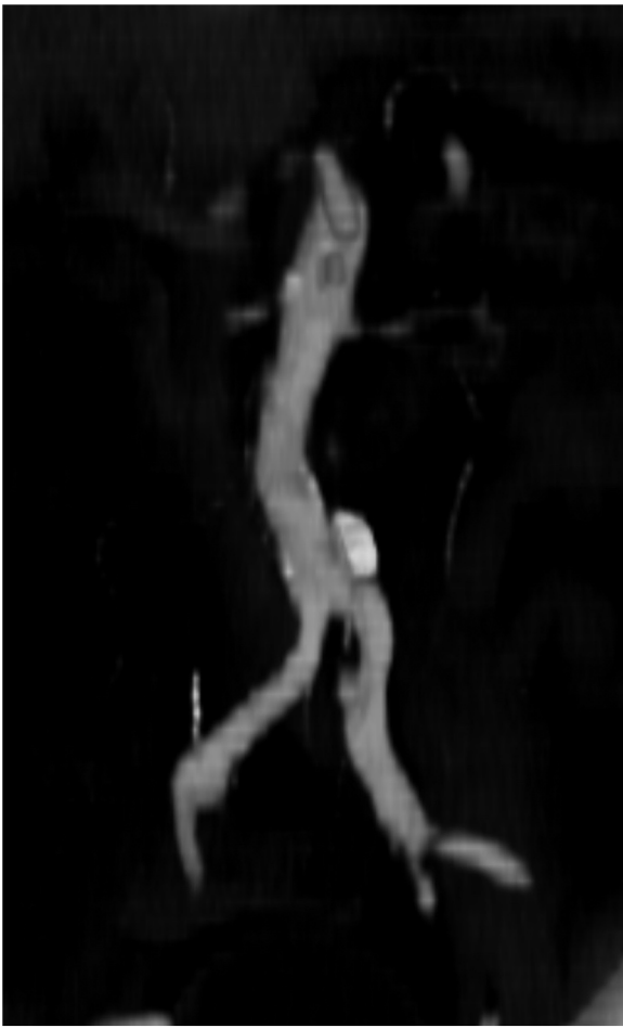
Fig. 1. Preoperative CT-angiography showing significant atherosclerotic disease in correspondence of the infrarenal aortic segment and right renal artery.