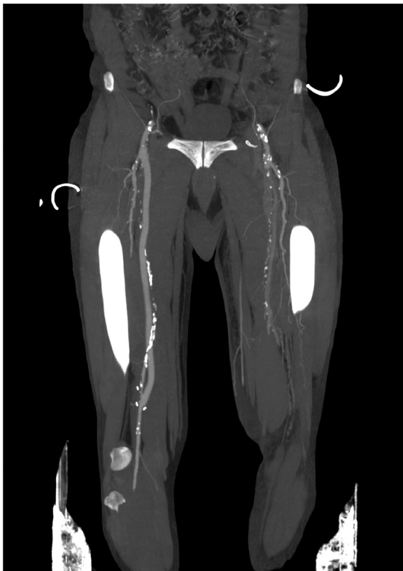
Fig. 4. Postoperative CT maximum intensity projection showing maintained patency of the femoro-popliteal bypass.

bypass (Fig. 4). The clinical examination showed the complete ulcers healing.