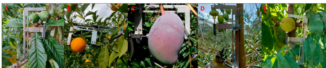
Figure 4. LVDT fruit gauges mounted in loquat (A), orange (B), mango (C), olive (D), and peach (E) fruit.