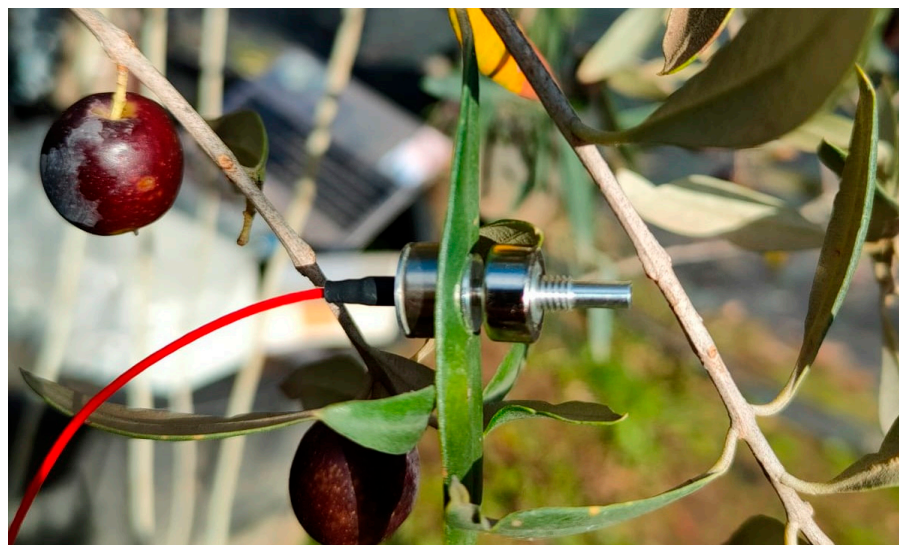
Figure 1. LPCP probe mounted in an olive leaf.

The sensor was validated in Tetrastigma vonierianum plants grown in greenhouses [29]. The probe is composed of two metal magnetic pads. One of the pads incorporates a pressure-sensing chip. These magnets are strategically positioned on both the adaxial and abaxial sides of a leaf, ensuring that the pressure chip maintains close contact with the leaf surface. The distance between the magnets above and below the clamped leaf patch can be adjusted by regulating the separation between the two magnets, depending on the thickness and rigidity of the leaf. The sensors are connected by wire to a radio transmitter that sends the output directly to a gateway located in the field. After that, the output is transmitted to a server via a general packet radio service (GPRS) system. The data can be accessed via a cloud platform.