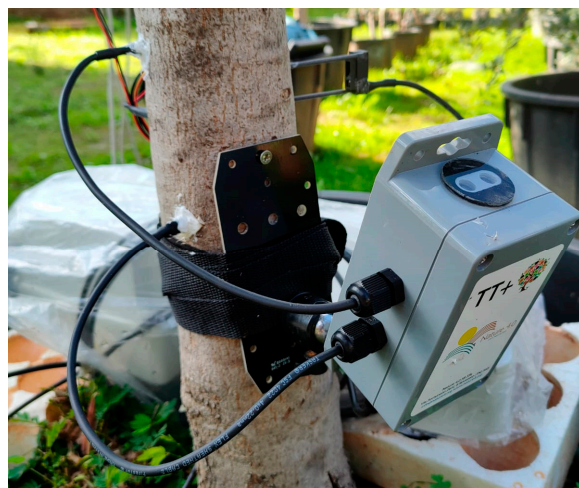
Figure 3. TreeTalker ® mounted on an olive trunk.